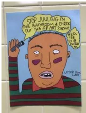
An anti-JUULing poster is on display in a Shorewood High School restroom.

The device is designed to be an alternative to combustible tobacco products, like cigarettes, and includes flavored JUUL "pods" that range from "Virginia Tobacco" to "Crème Brulee." JUULs, which are small and sleek enough to be easily mistaken for a USB, use a regulated heating element to activate ingredients and create an aerosol vapor that users inhale.