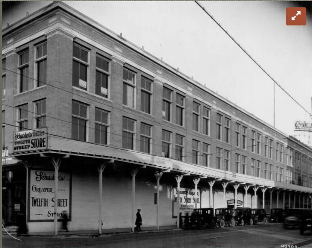
Milwaukee Public Library