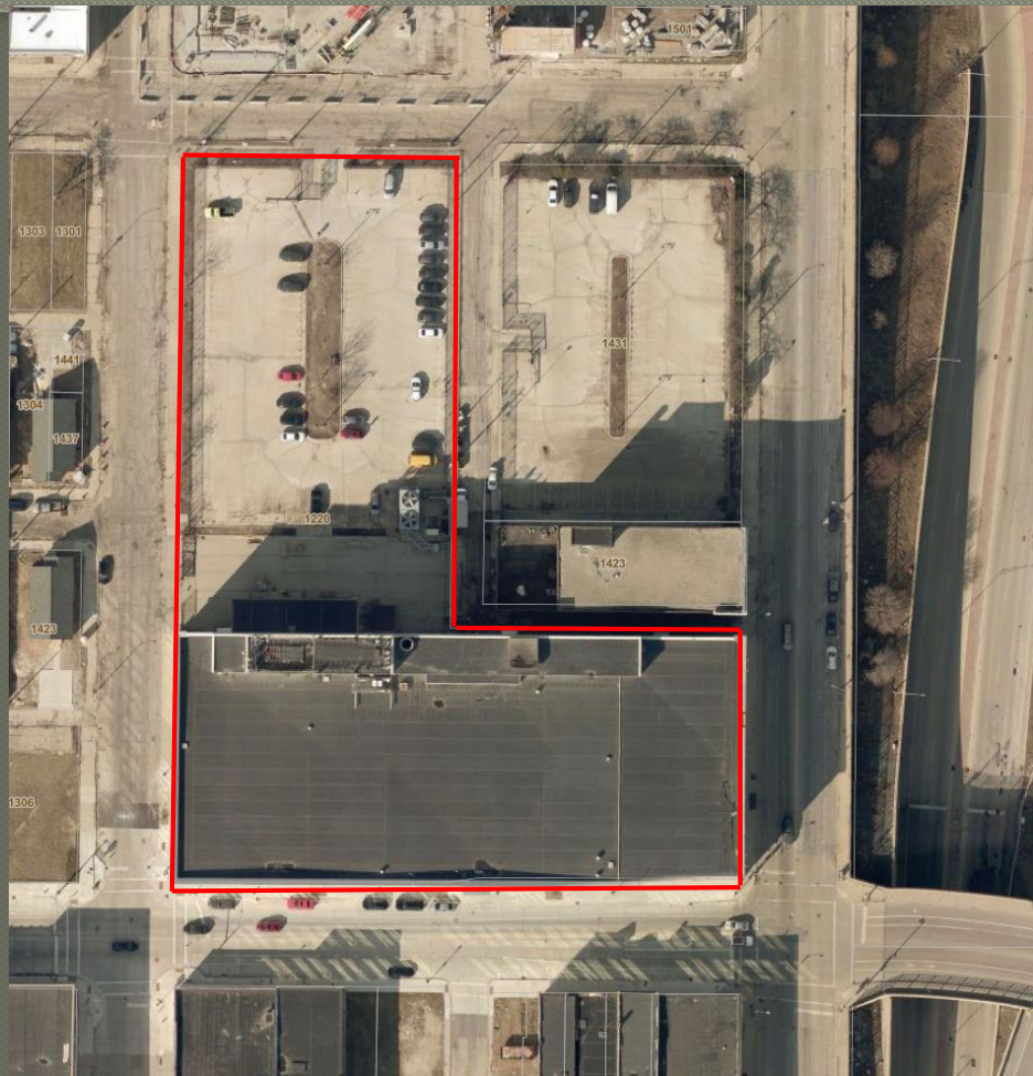
1220 West Vliet Street