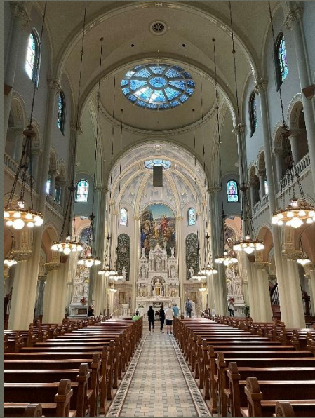
St. Joseph Convent & Chapel, 1914-1917