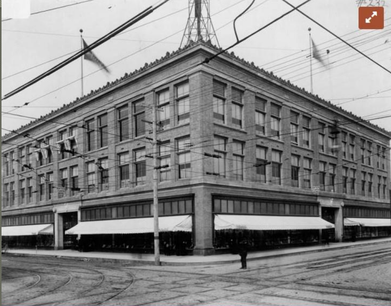
Milwaukee Public Library