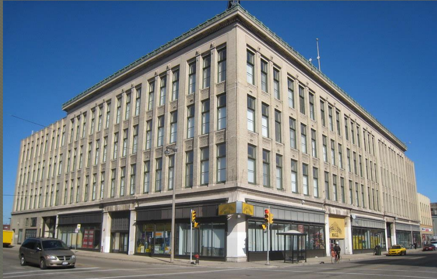
Mitchell Street Schuster's, 1914