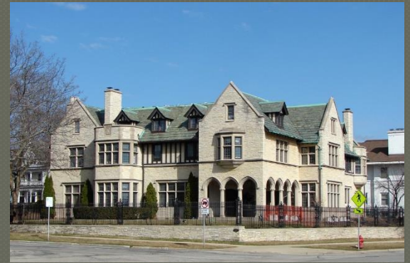
Gallun House, 1914