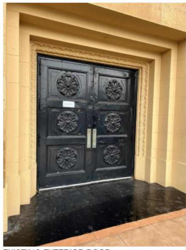
EXISTING EXTERIOR DOOR