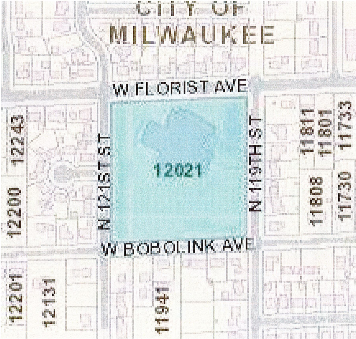
EXHIBIT B MAP SHOWING THE LOCATION OF THE PROPERTY