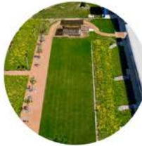
FONDY PARK 2201 W. MEINECKE AVE.

The Tandem offers full lunch and dinner menus that feature many familiar standbys including, a seasonal specials menu that boasts unique and ever-changing offerings and a 100-year-old wood bar that slings drinks to go with your meal!