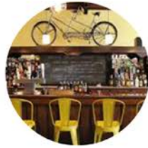
THE TANDEM 1848 W. FOND DU LAC AVE.

The Tandem offers full lunch and dinner menus that feature many familiar standbys including, a seasonal specials menu that boasts unique and ever-changing offerings and a 100-year-old wood bar that slings drinks to go with your meal!