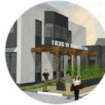
ADAMS GARDEN PARK 1836 W. FOND DU LAC AVE

One MKE Plaza will be home to: Milwaukee's newest boutique hotel, The IKON, Milwaukee's most energetic and mega-productive co-working and enterprise community; The Beehive, a state-of-the-art conference center; representation from Milwaukee's leading corporate partners, and over 20 thriving small businesses.