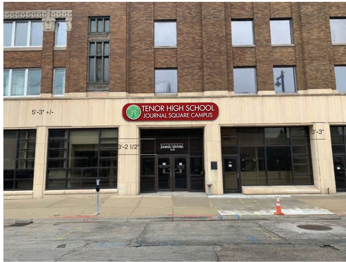
proposed layout - day view