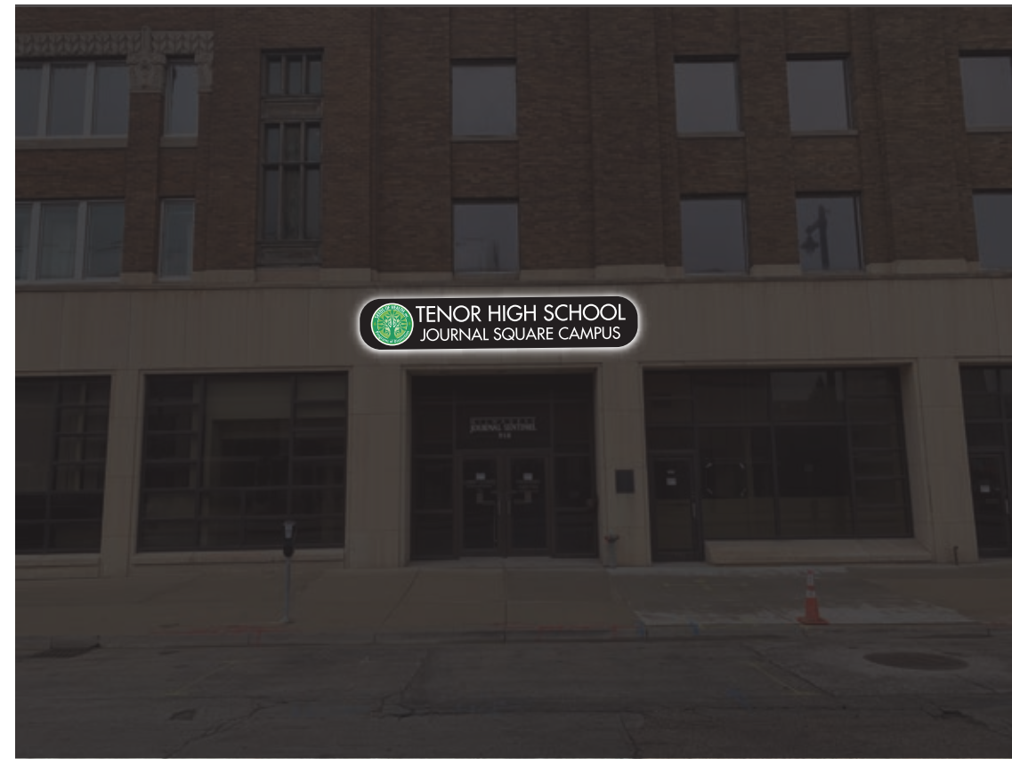
proposed layout - night view