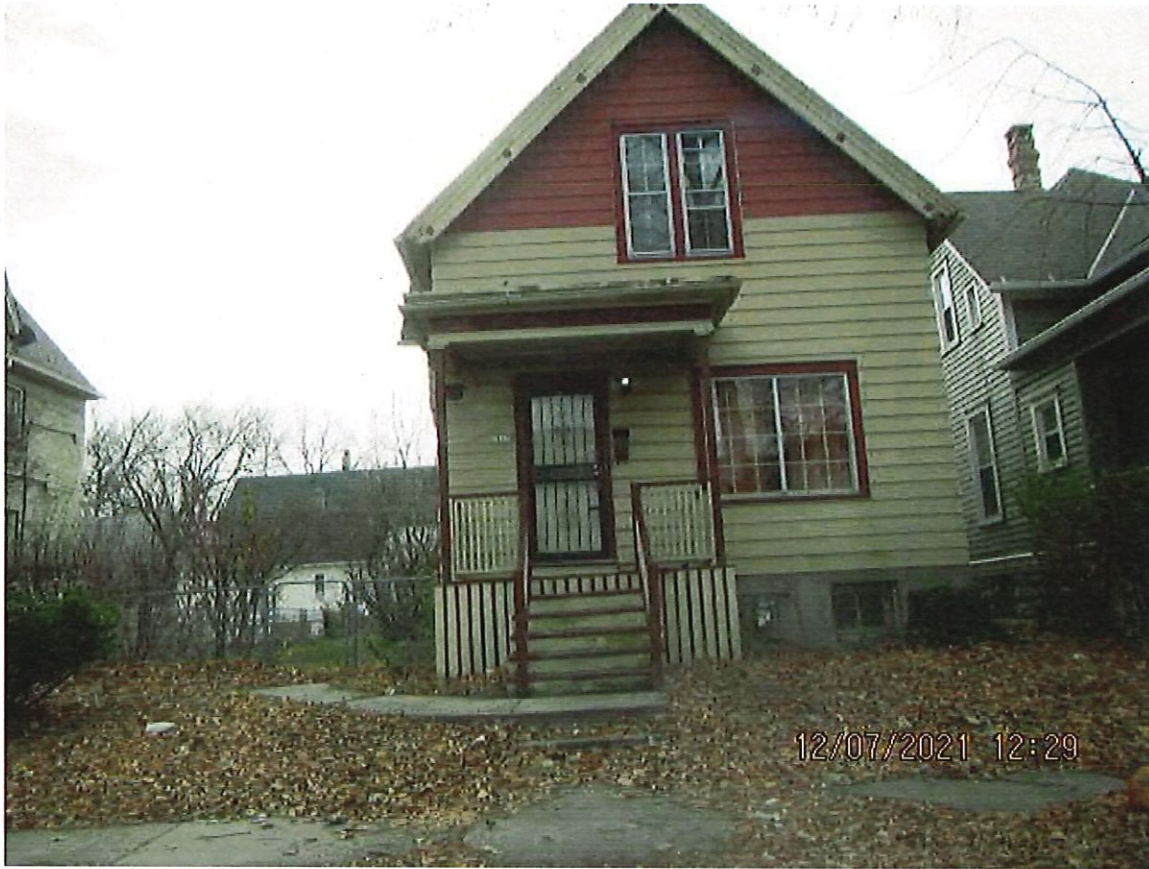
2313 w Galena Street