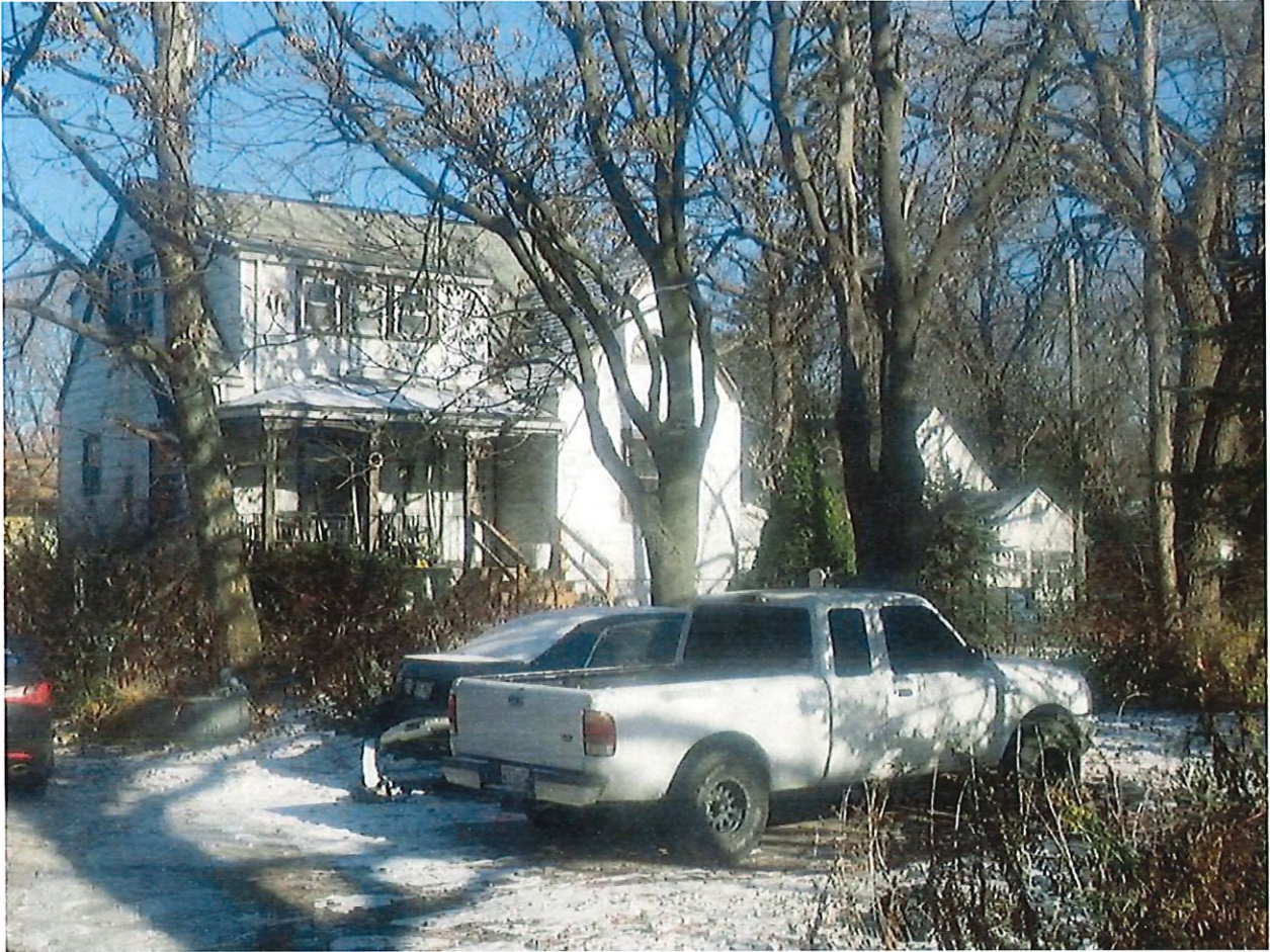
Above: Photo of the Subject Property (7020 W Mill Rd)