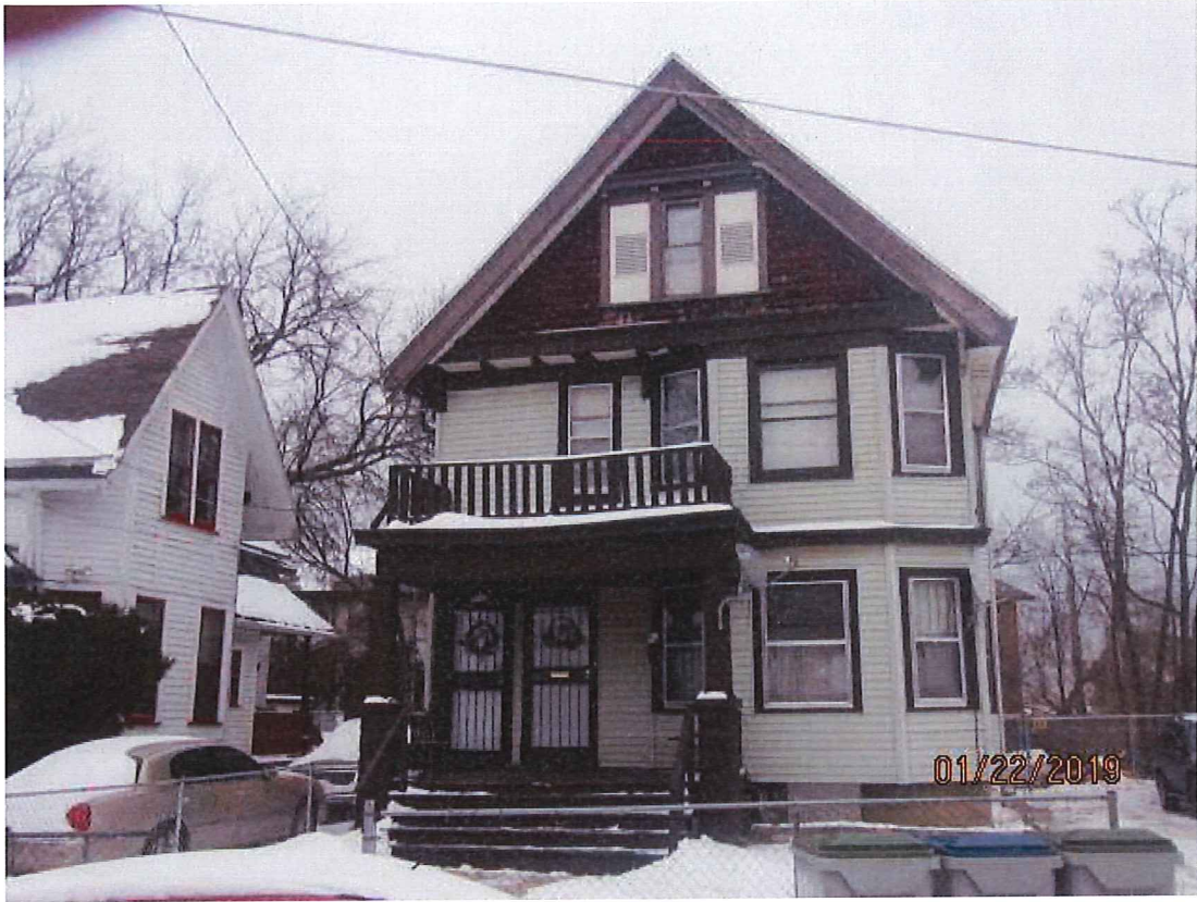
3140 N Julia