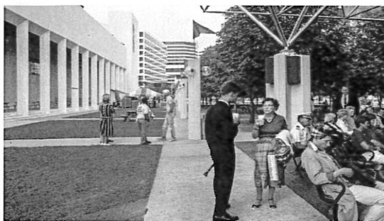
Marcus Center for the Performing Arts, Milwaukee, WI

2019 to assess the health of the trees, had not been retained to perform regular maintenance on the grove prior to that time. In the summer of 2016, the Center touted itself as "a facility with virtually no deferred maintenance."