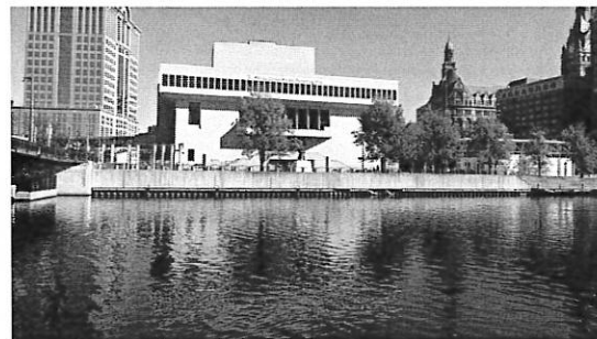
Marcus Center for the Performing Arts, Milwaukee, WI

Representatives from the Marcus Center spoke against the designation, citing alterations to the building, including the replacement of its travertine cladding with limestone in the mid-1990s, as sufficient reasons to deny it historical status. But as the preservation staff report had also indicated, several Milwaukee structures have received local historic designation despite significant alterations to their building fabric.