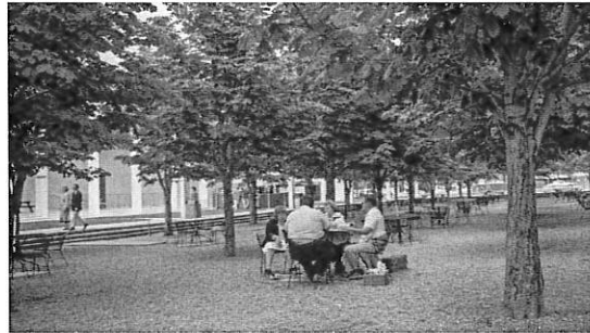
Marcus Center for the Performing Arts, Milwaukee, WI - Photo by Joe Karr, 1986

On April 1, 2019, the Milwaukee Historic Preservation Commission (HPC), in a four-to-one vote, granted permanent historic designation to the Marcus Center for the Performing Arts and its grounds, including Dan Kiley's grove of 36 horse chestnut trees. The commission also voted to allow four of the trees, recently determined to be in bad health, to be replaced within the period of one year. The HPC's decision will eventually come before the Milwaukee Common Council, which may yet veto ( https://www.jsonline.com/story/money/real-estate/commercial/2019/04/01/milwaukee-marcus-center-gets-historic-status-but-trees-could-still-go/3330324002/ ) the historic designation.