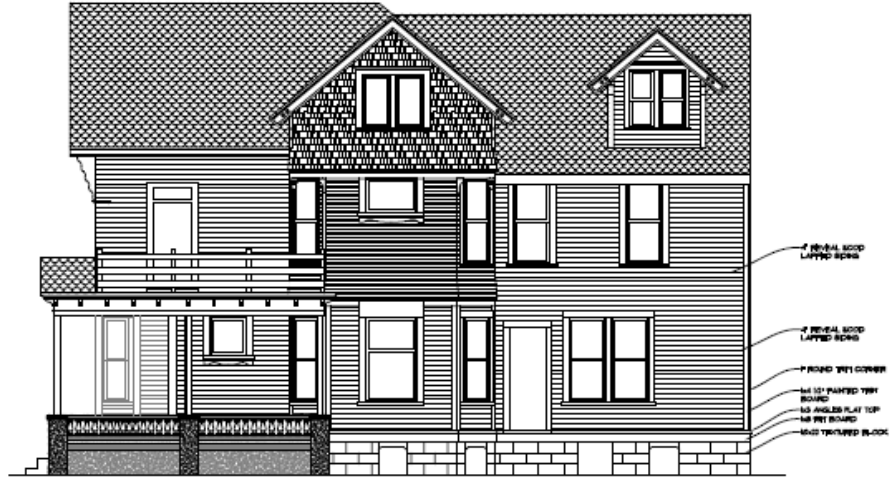
EXISTING STREET ELEVATION