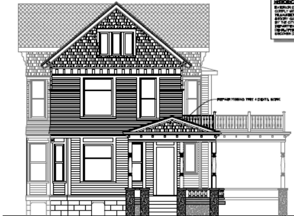
PROPOSED STREET ELEVATION