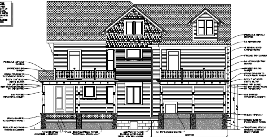
PROPOSED STREET ELEVATION

STRUCTURAL NOTES REPAIR CRACKS THAT OCCUR WITH THE CITY OF PEASBERRY LOCAL ORDINANCE 100000 AS RELEASED BY THE CITY OF PEASBERRY DEPARTMENT OF CITY DEVELOPMENT/PLANNING BROOKER DATED 08/11