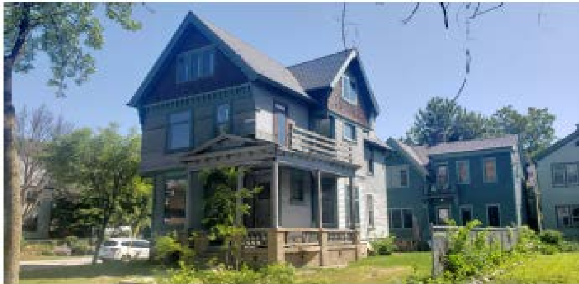
Existing property conditions