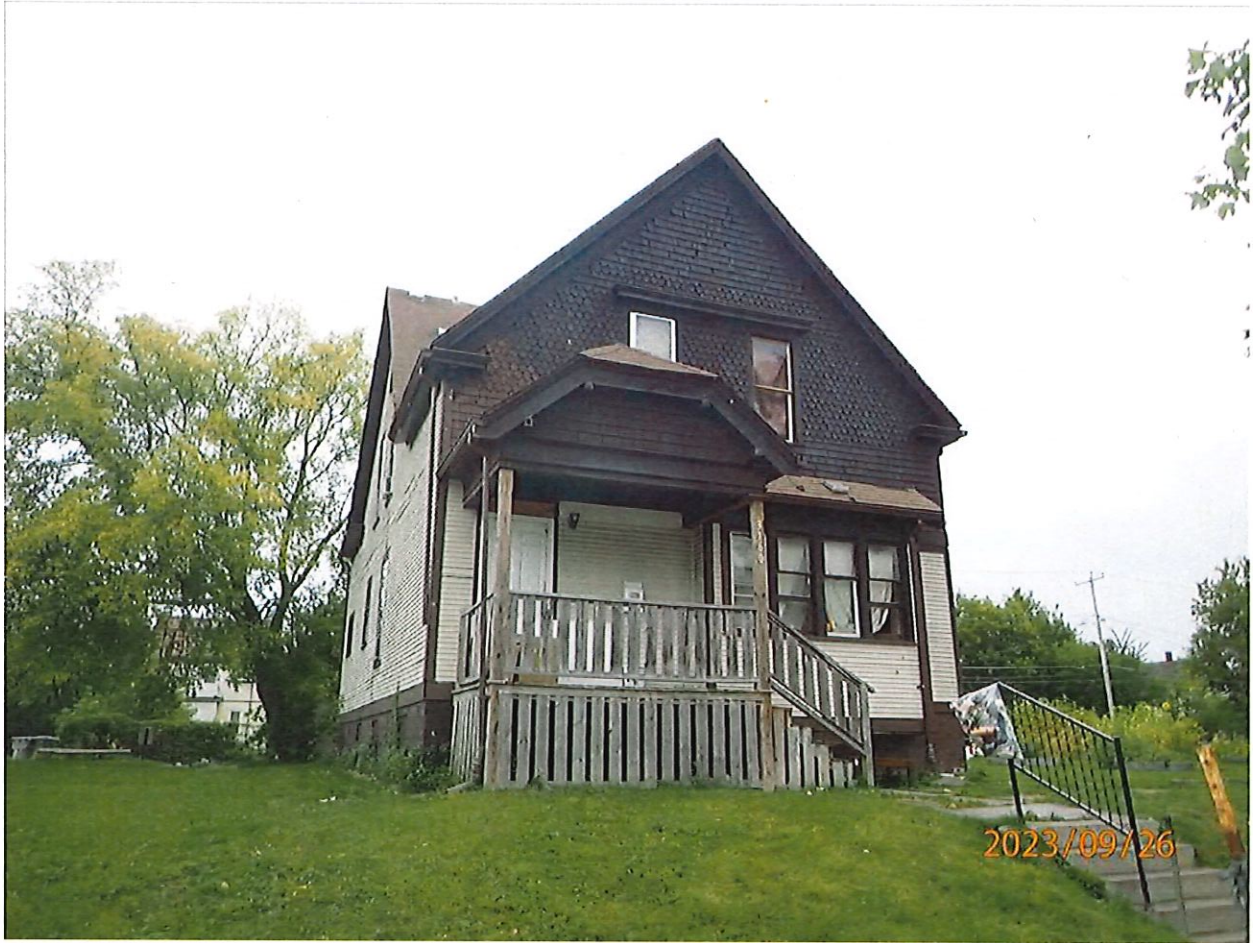
3160-30A North 9 th Street