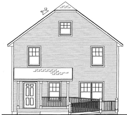
FRONT ELEVATION SCALE: 3/16" = 1'-0"

NOTE: TO BE DETERMINED LOT SPECIFIC. FINAL DESIGN & SPECS BY IFA.