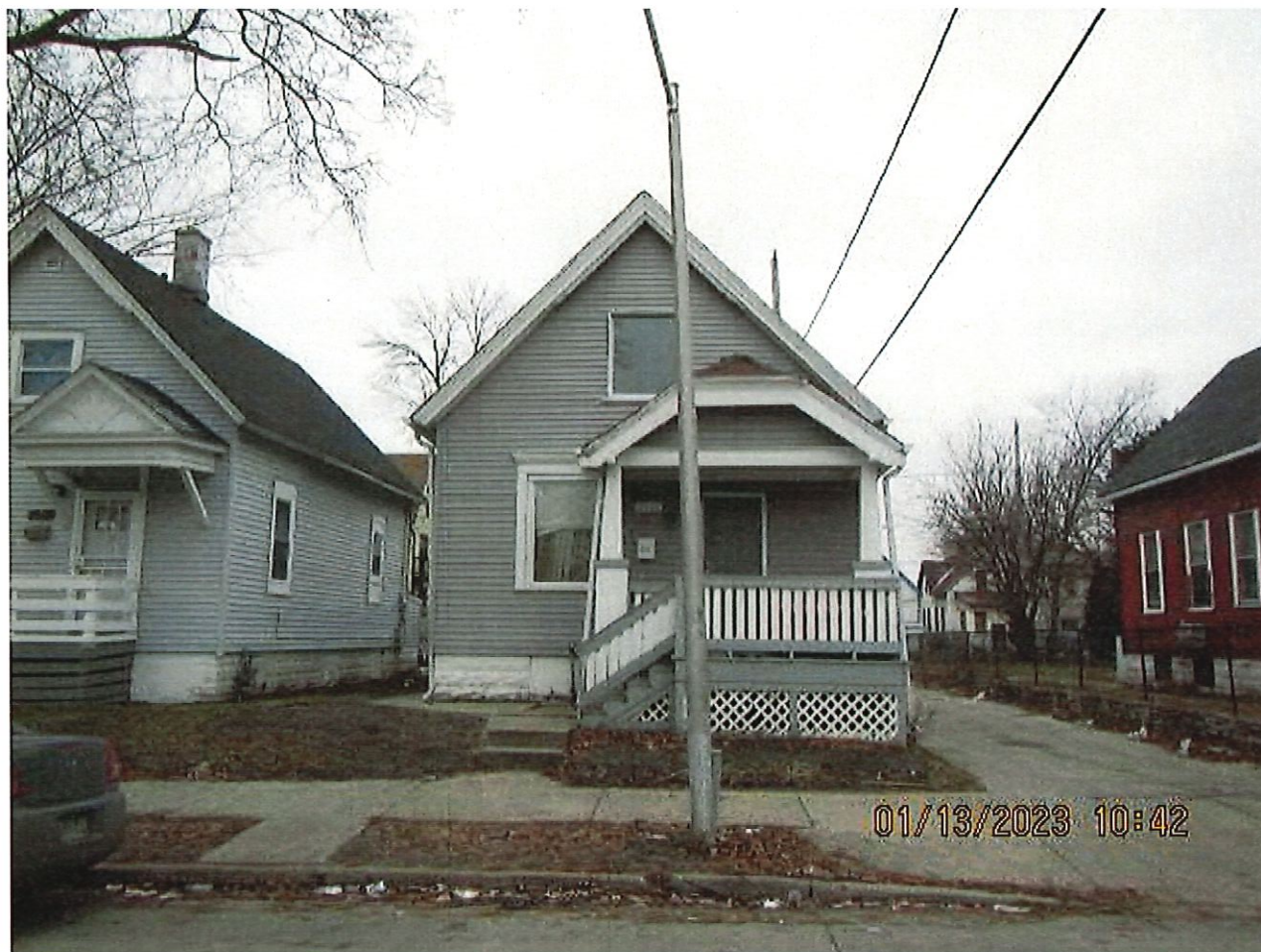
2615 North 19 th Street