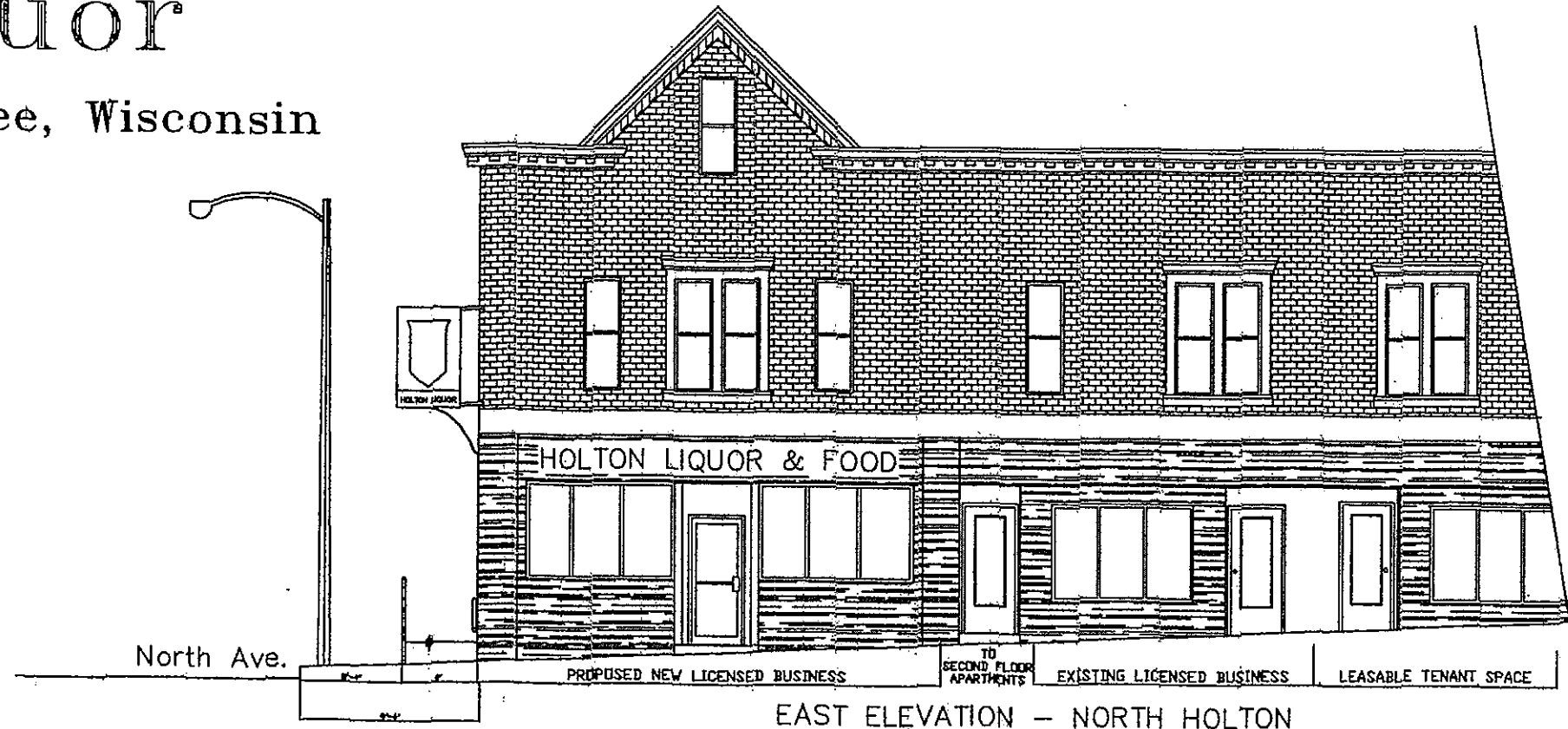
EAST ELEVATION - NORTH HOLTON

2301-2309 N. Holton, Milwaukee, Wisconsin