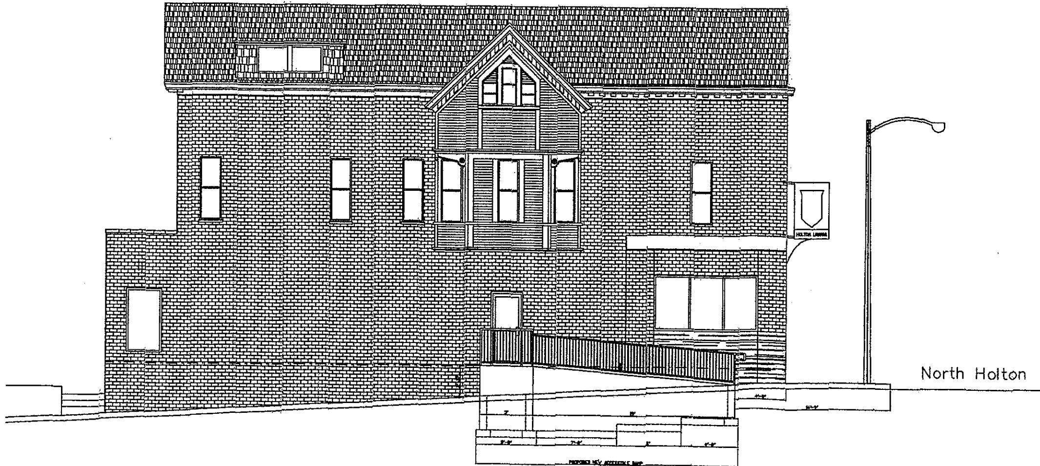
SOUTH ELEVATION - NORTH AVE.