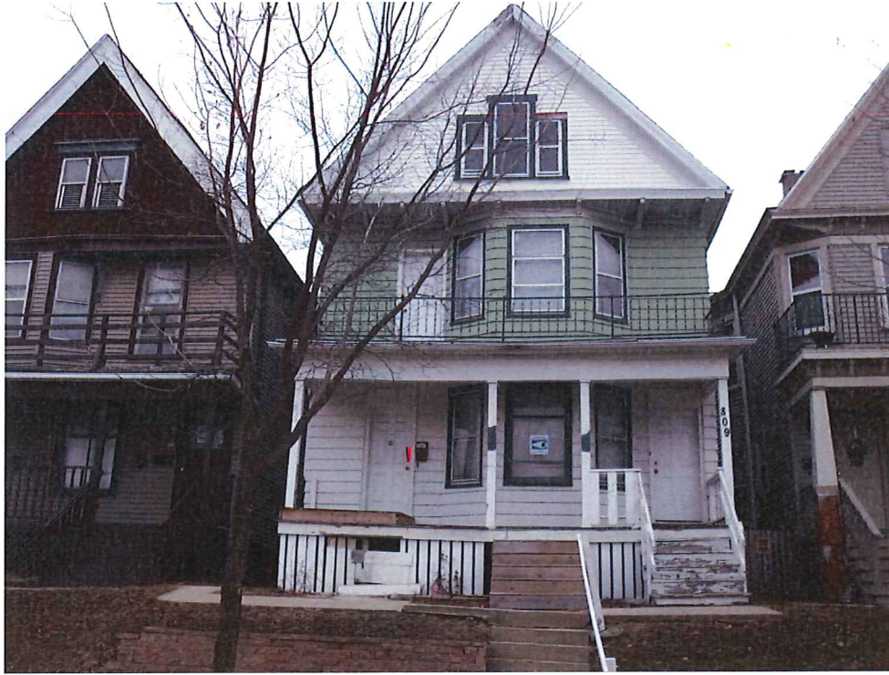
809 S 28 th Street