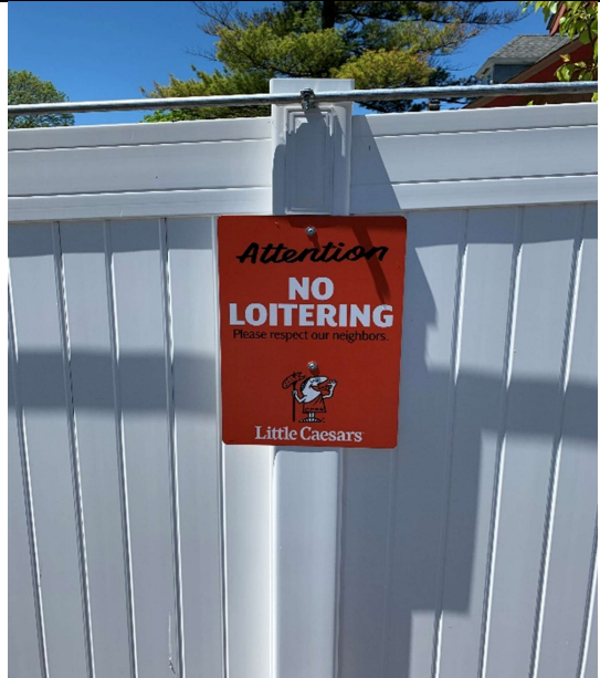
Signage on Fence Along Western Boundary