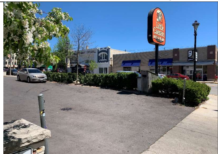
Across Parking Lot Facing East