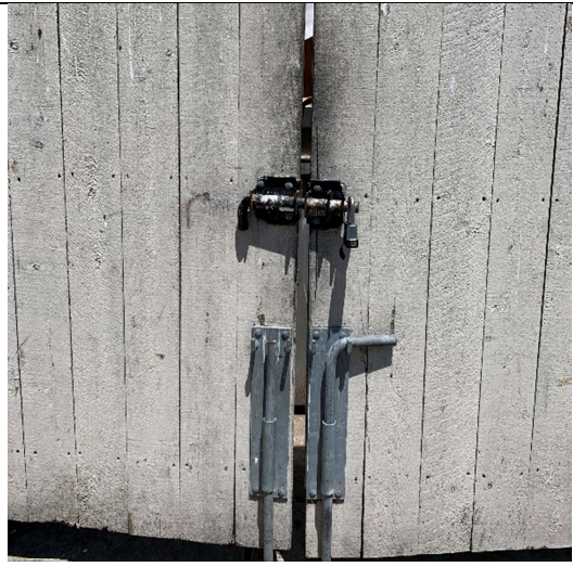
Locked Dumpster Enclosure