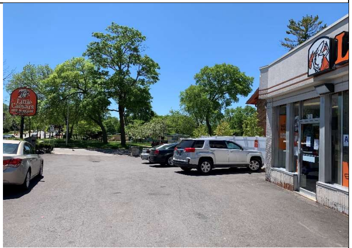
Across Parking Lot Facing South