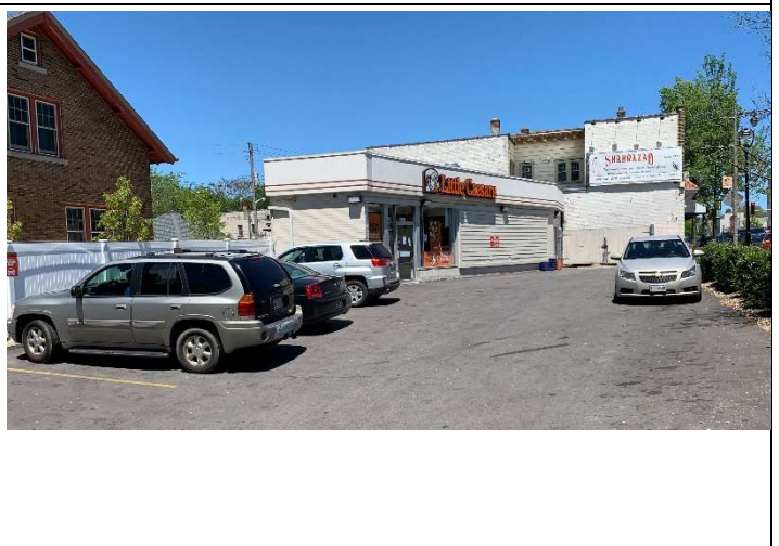
Across Parking Lot Facing North