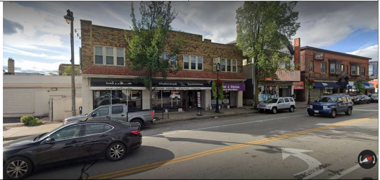
West Side of North Oakland Ave, Adjacent and North of Little Caesars