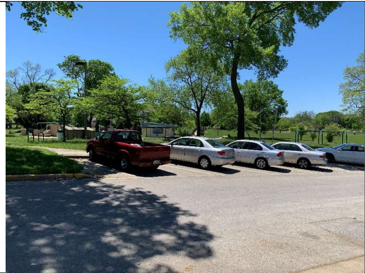
South Across East Geneva Place