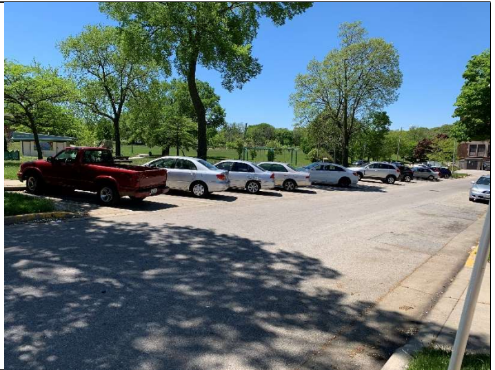
Southwest Down East Geneva Place