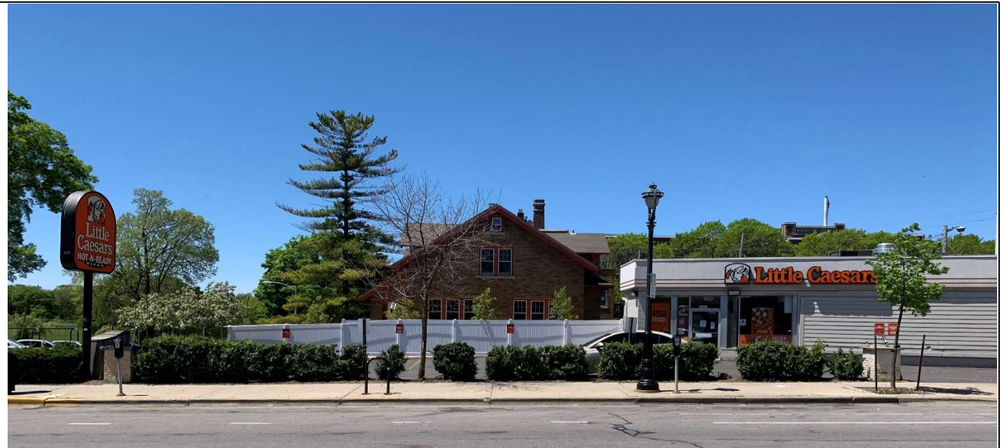
Facing West Across Oakland Avenue