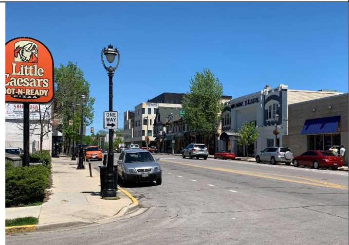
Northeast Down Oakland Avenue