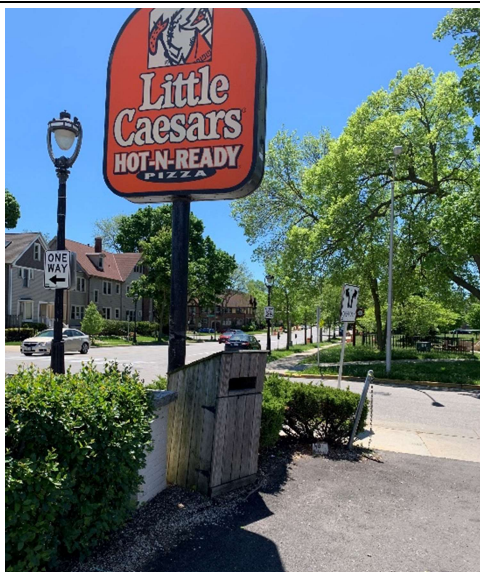
Trash Container Southeast Corner