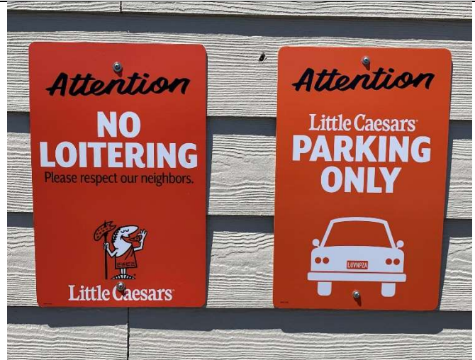
Signage on Building