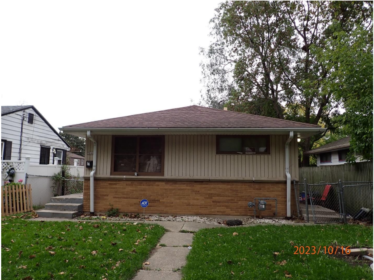
5846 North 66 th Street