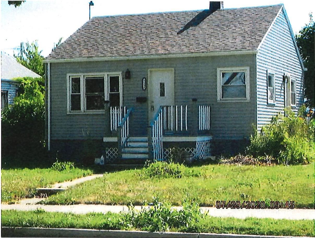
3330 South 20 th Street