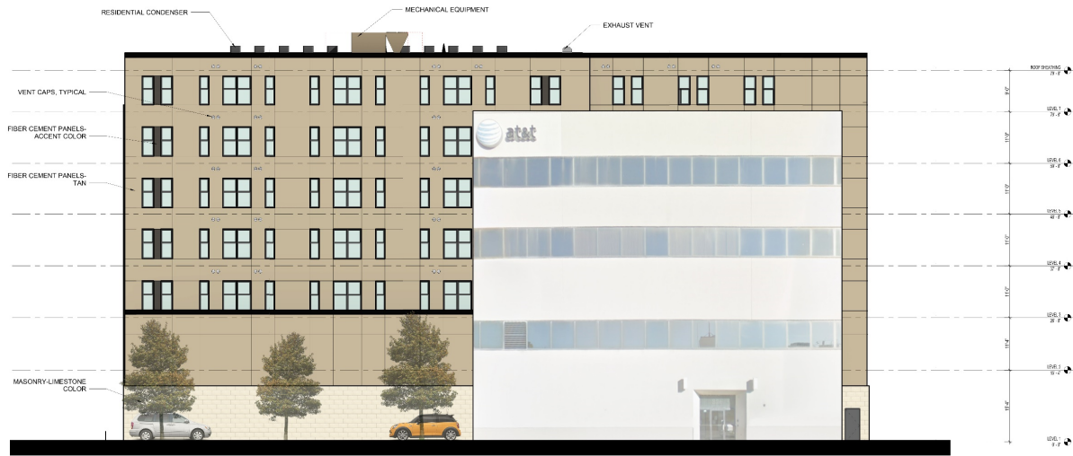
① SOUTH ELEVATION SCALE: 1/8" = 1'-0"