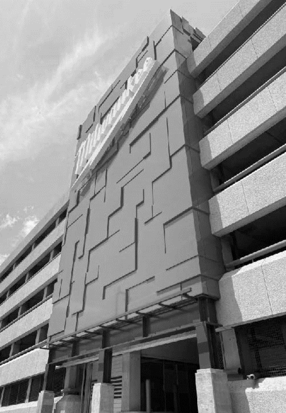
Table 10: Apprentice and/or On-the-Job Training by Gender