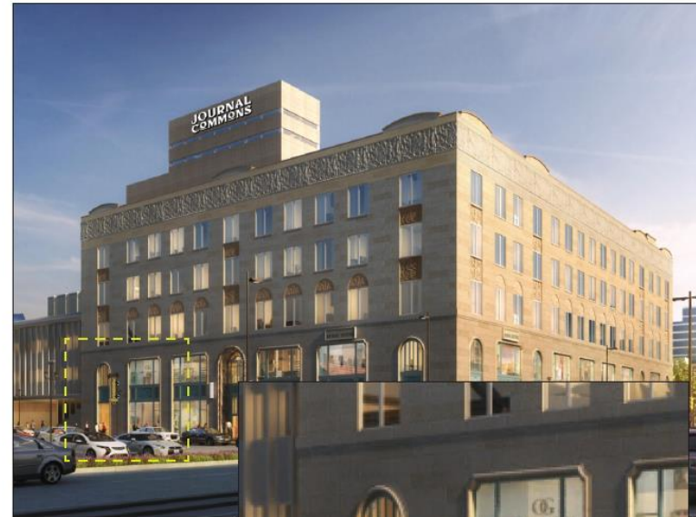
PROPOSED VIEW, NTS