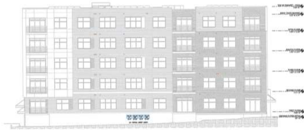
1 M8 NORTH ELEVATION SCALE 1/8"=1'-0"