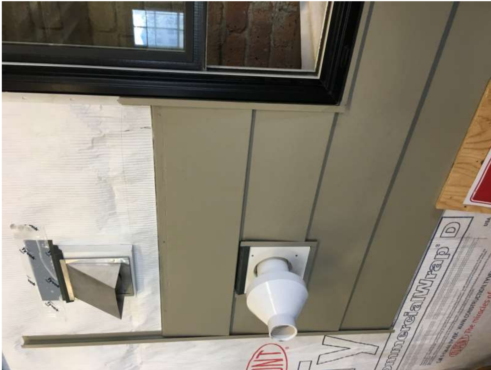
Vents are proposed as above and must be painted to match surrounding surfaces.