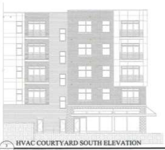
3 HVAC COURTYARD SOUTH ELEVATION M8 SCALE: 1/8"=1'-0"