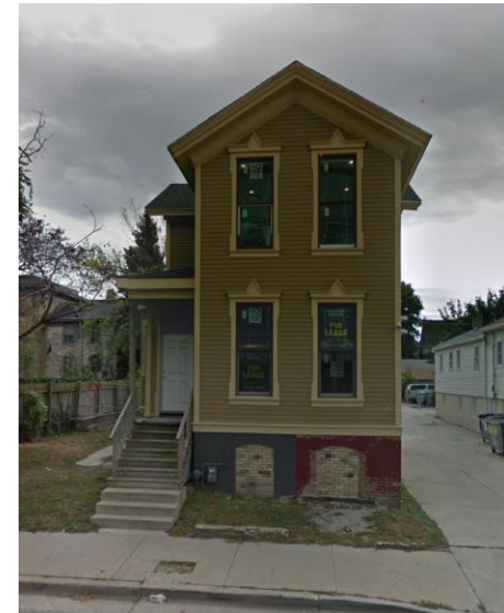
Property at 317 West National

PLEASE CHECK ALL PROOFS FOR ACCURATE SPELLING, PUNCTUATION AND LAYOUT. Signarama Milwaukee will not be held responsible for correcting mistakes on approved artwork. 5061 W. STATE ST. MILWAUKEE, WI 53208