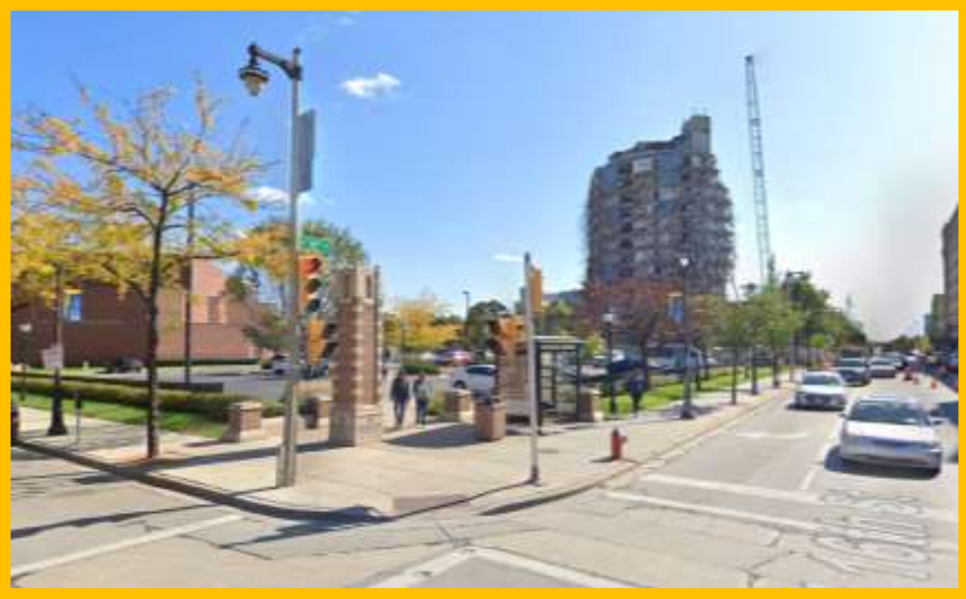
View from 16 th and Wells looking south-east (Oct/2020)