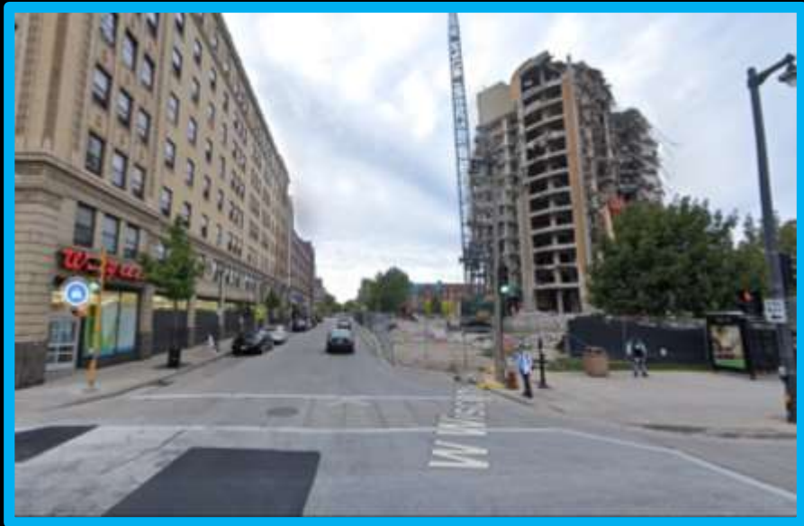
View from 16 th and Wisconsin looking north (Oct/2020)