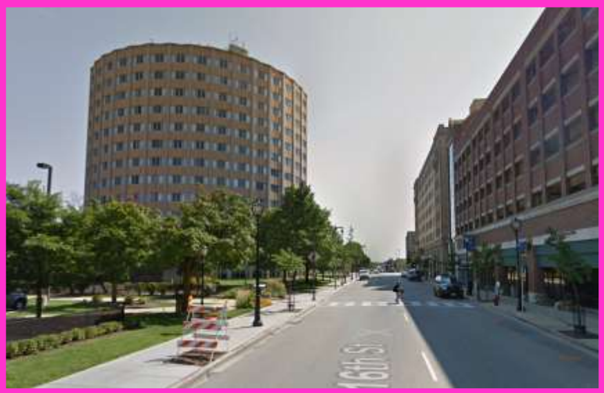
View from N. 16 th St. looking south (Aug/2017)