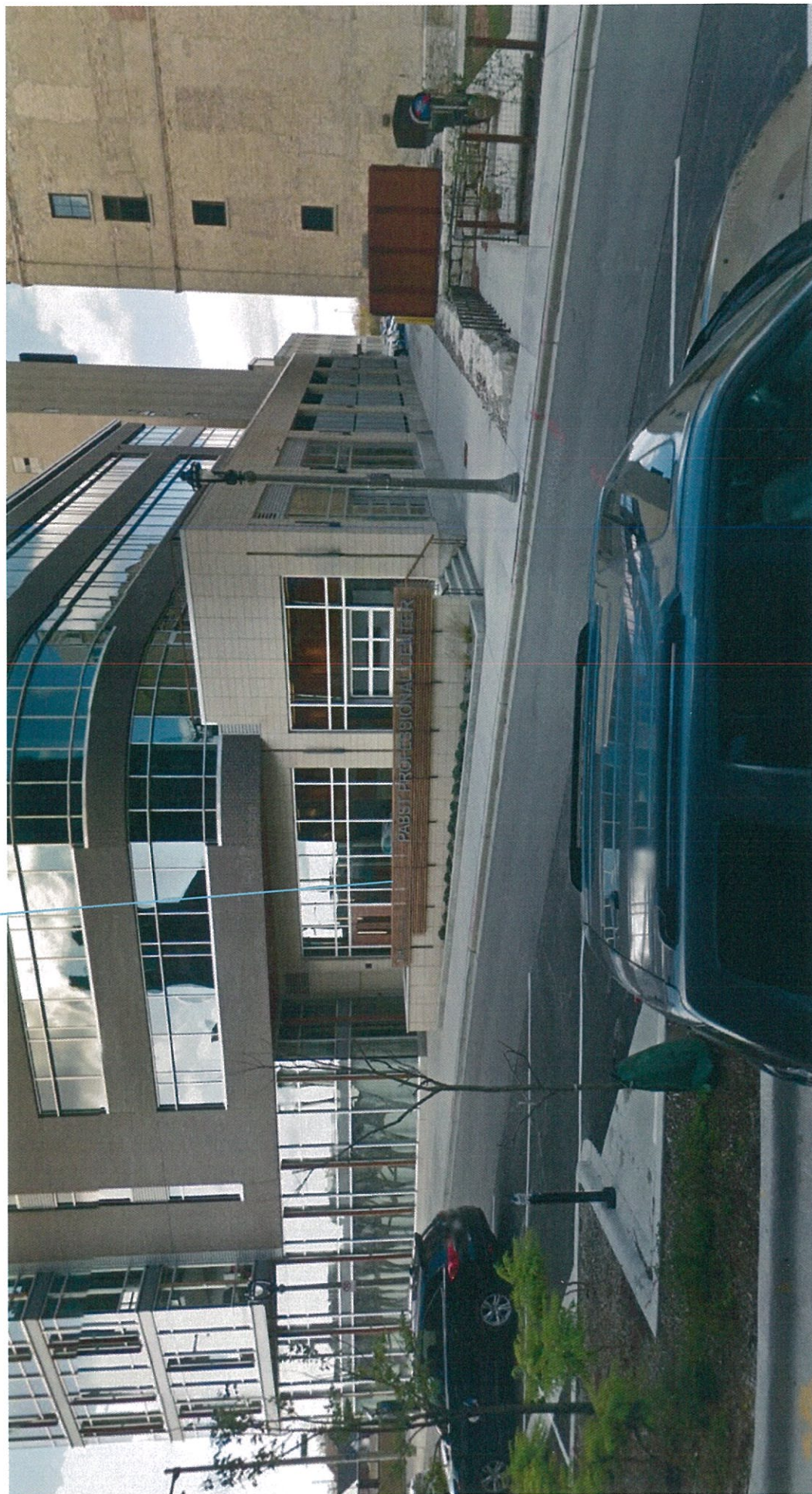
Klements aluminum 'fence' sign at the Pabst Professional Center, 1036 W. Juneau