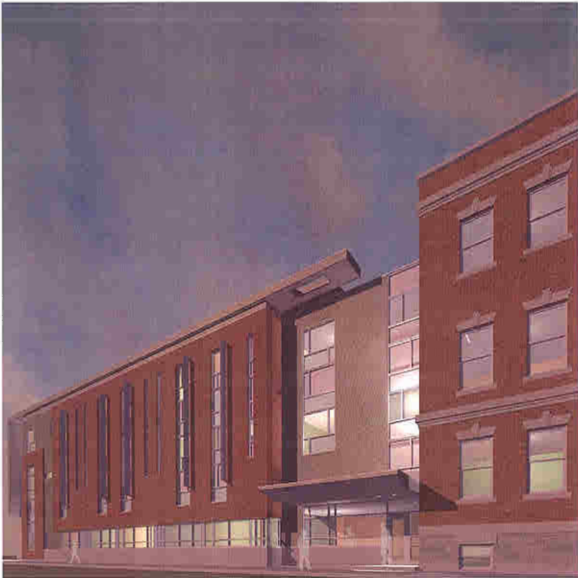
View of Building Addition and Main Entry 13 th Street looking to the North