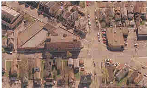
Aerial View: Looking towards the east.