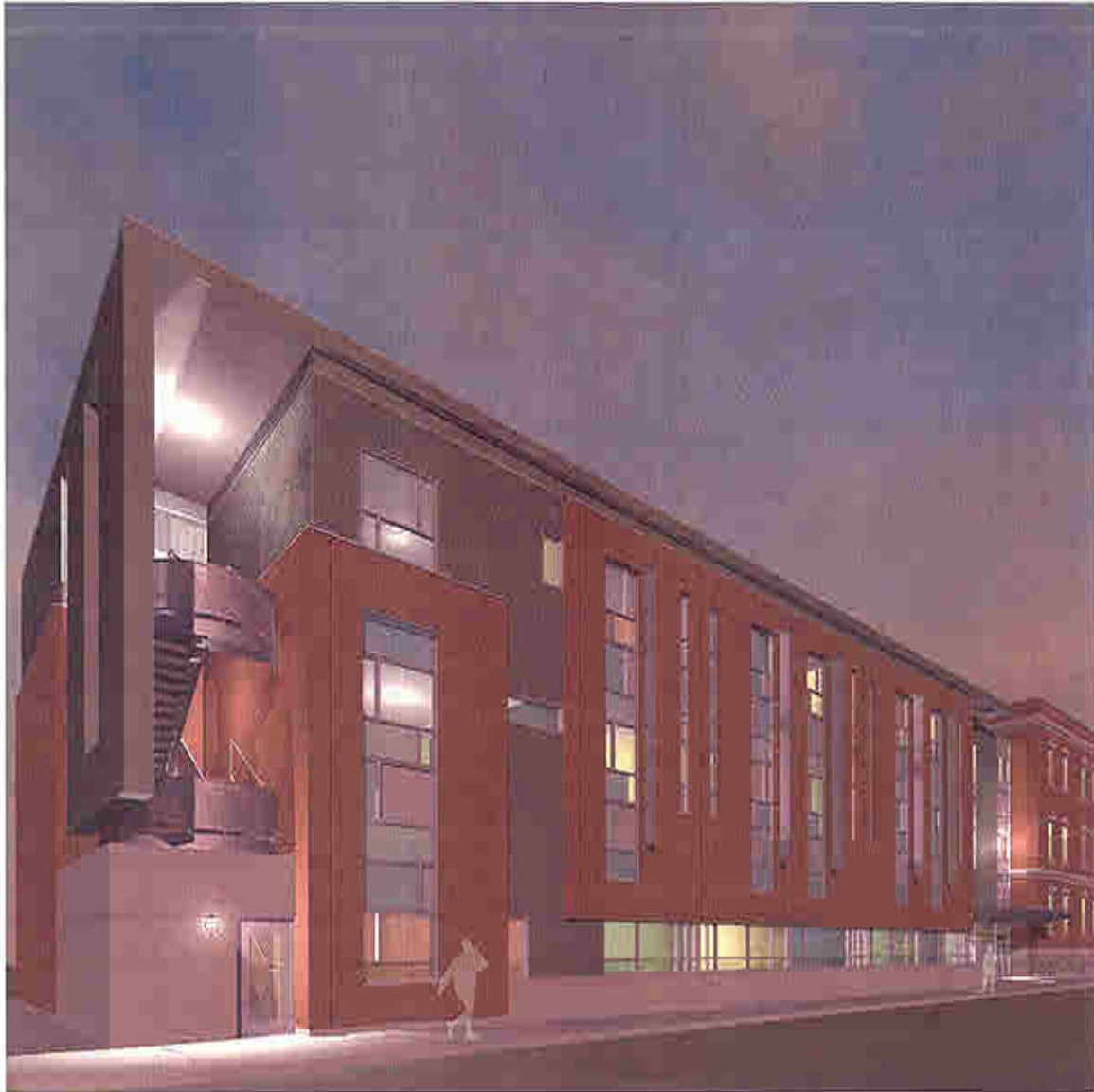
View of Building Addition 13 th Street looking to the South