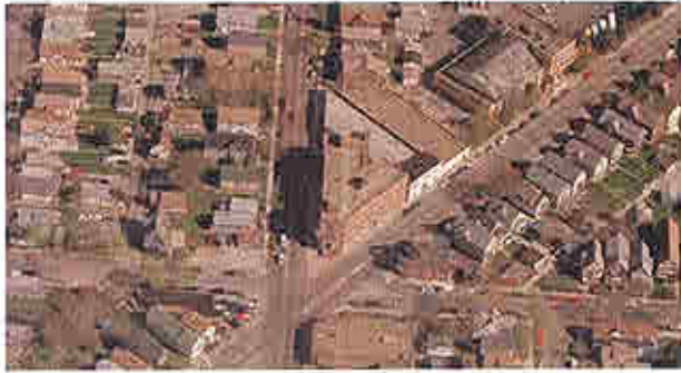
Aerial View: Looking towards the north.

TOUR OF BUILDING: 1230 W. Grant Street and 1220 W. Windlake Avenue