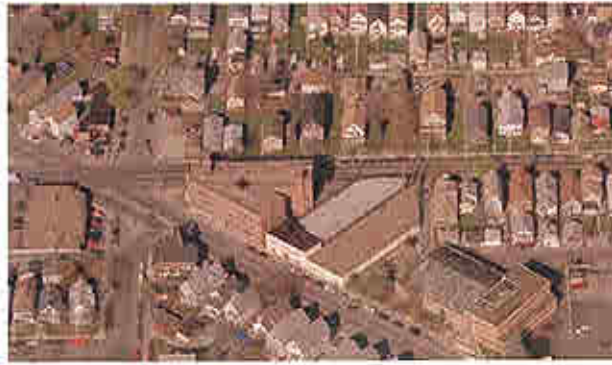
Aerial View: Looking towards the west.

TOUR OF BUILDING: 1230 W. Grant Street and 1220 W. Windlake Avenue