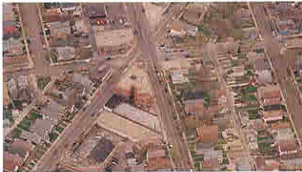
Aerial View: Looking towards the south.