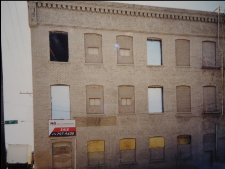
1236 W. Pierce St. - IH to IM Before Restoration