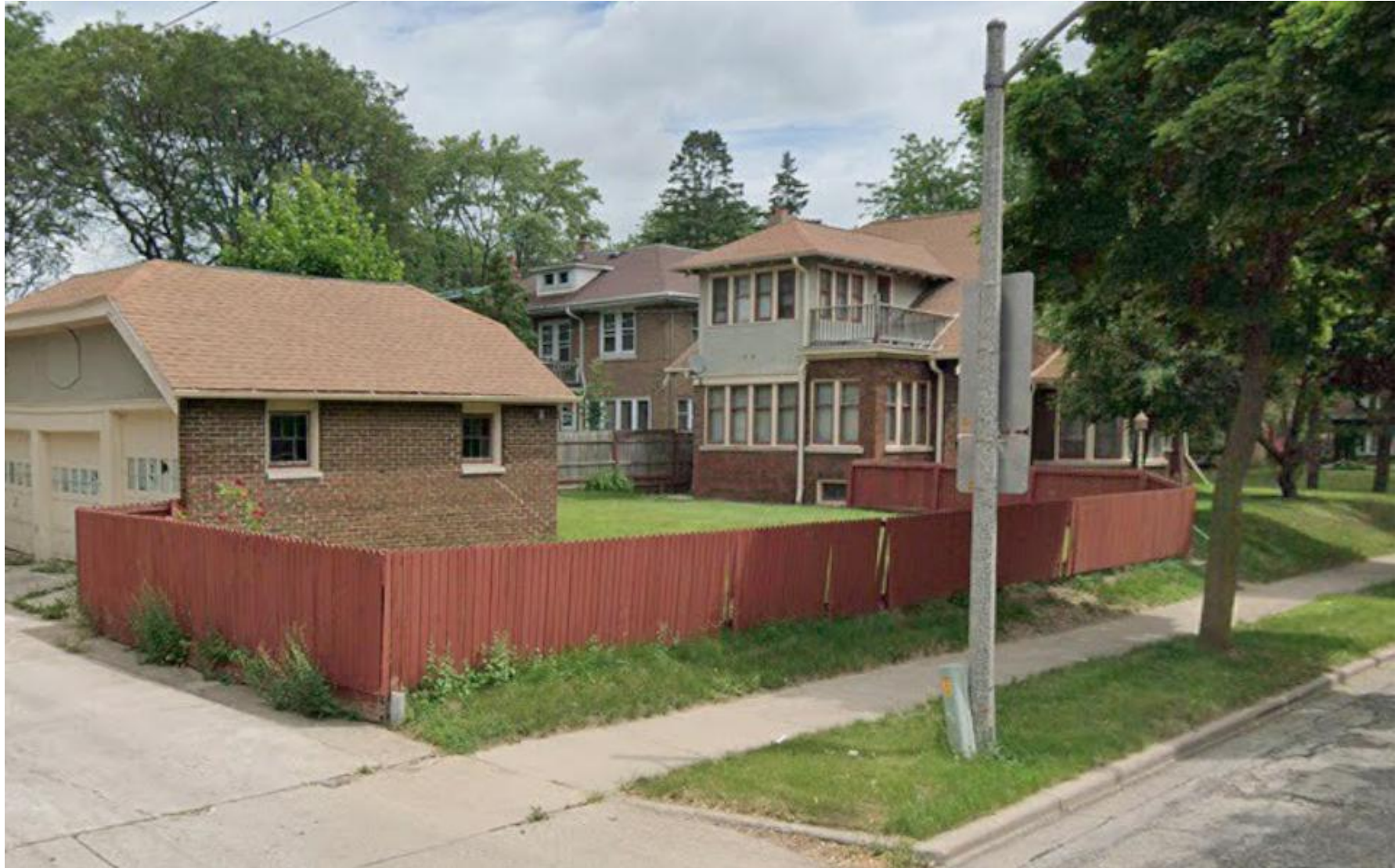
Existing fence to be removed