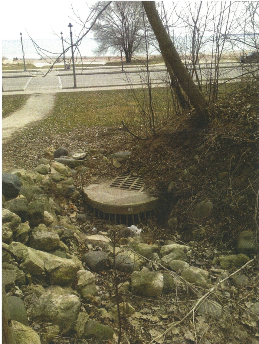
Existing outlet structure to Bradford Beach infiltration dunes (Photo taken 3/30/15)