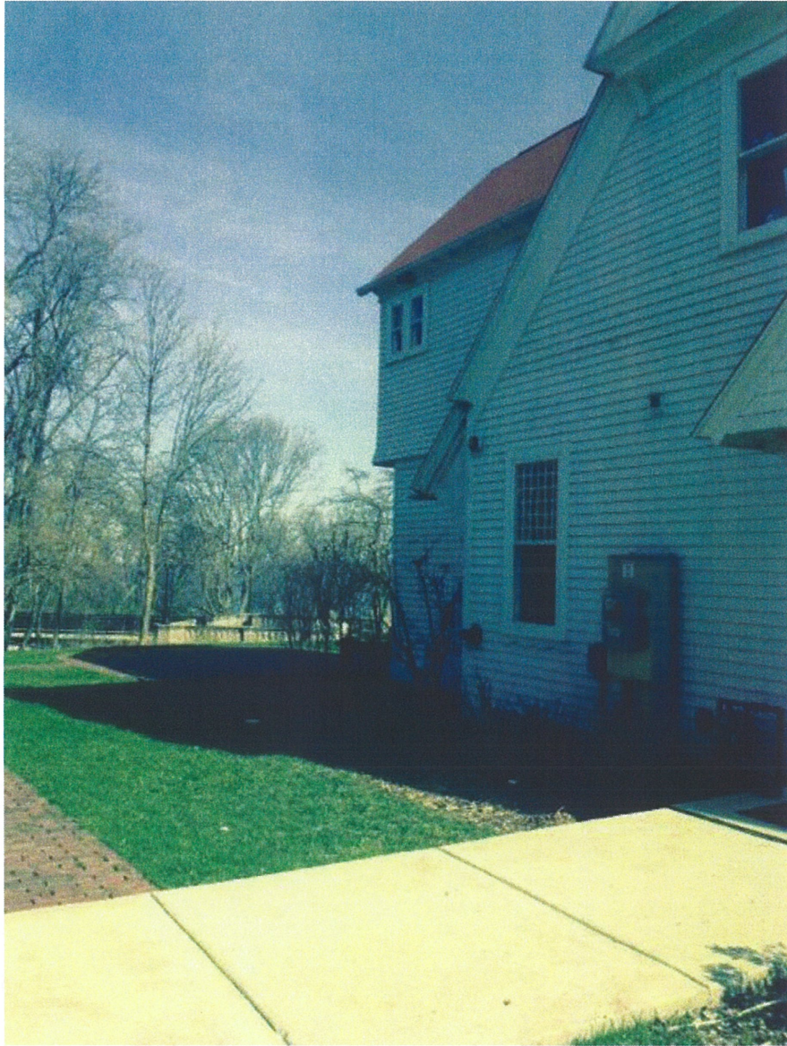
Existing roof drainage to be redirected to new rain garden (Photo taken 4/28/15)