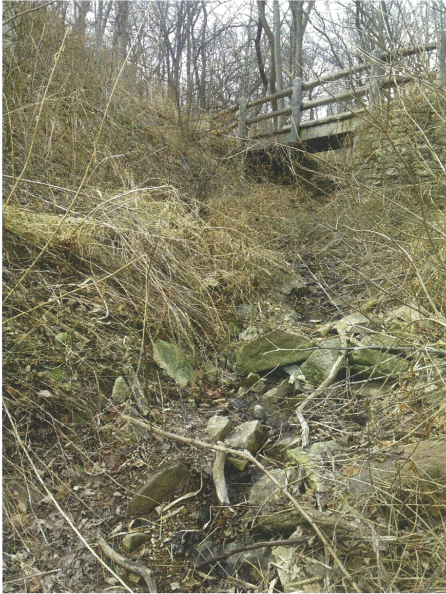
Headwater of proposed RSC in South Ravine (Photo taken 3/30/15)