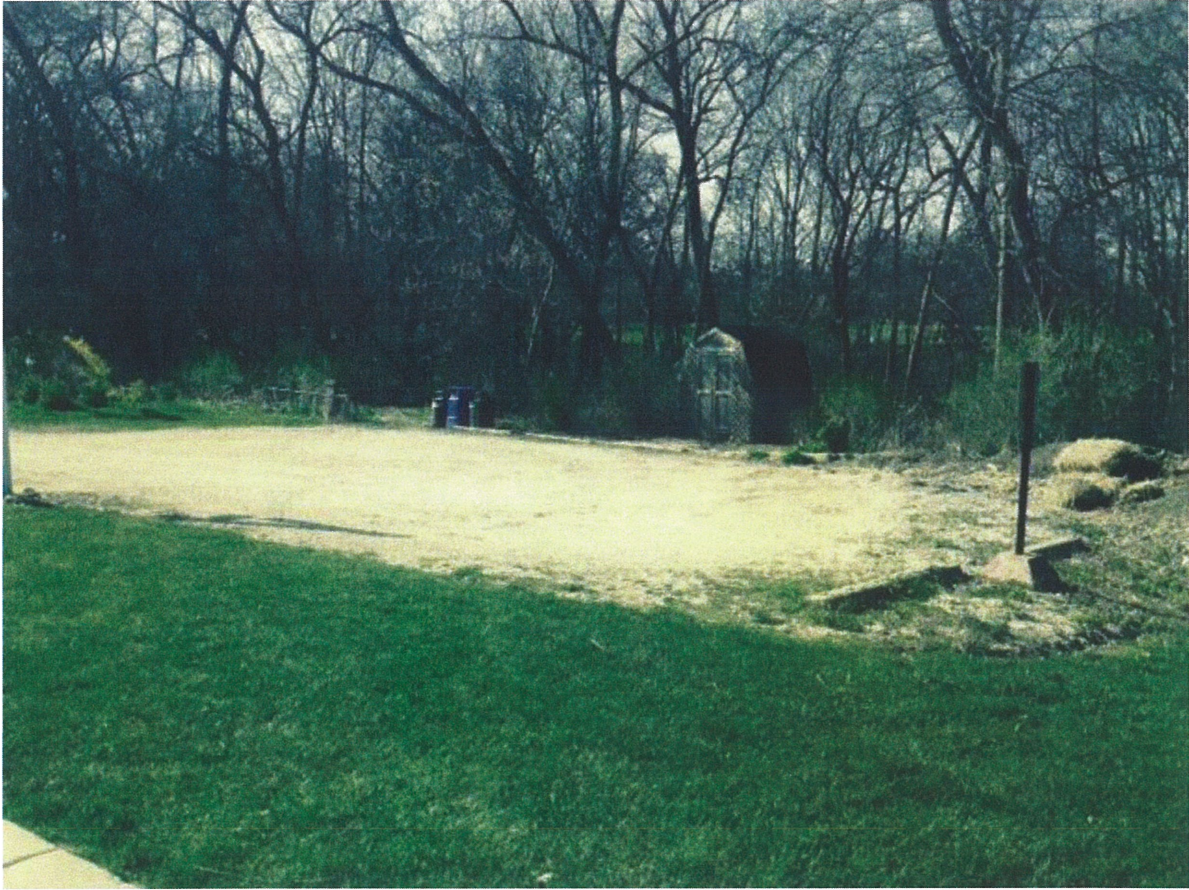
Existing parking area to be converted to porous pavement (Photo taken 4/28/15)