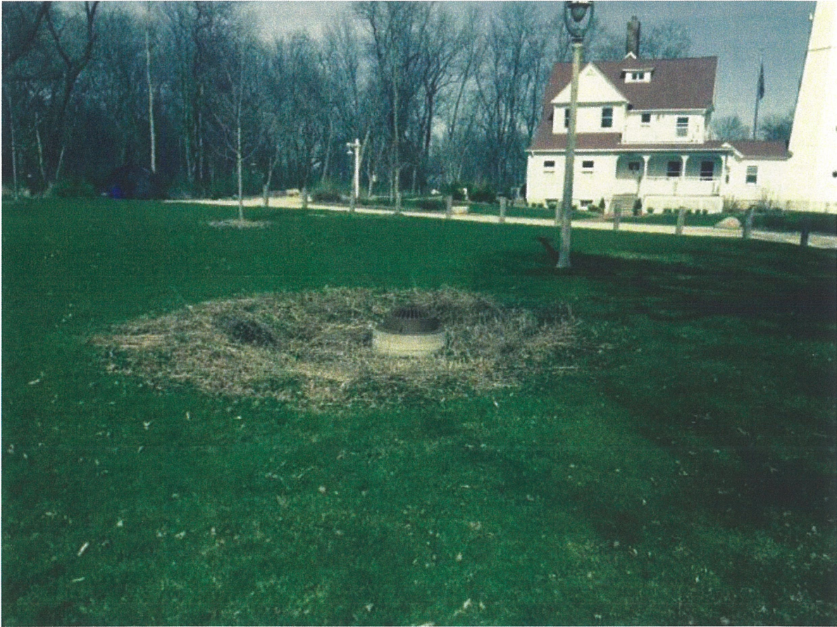
Existing rain garden to be expanded by 2000 sf (Photo taken 4/28/15)