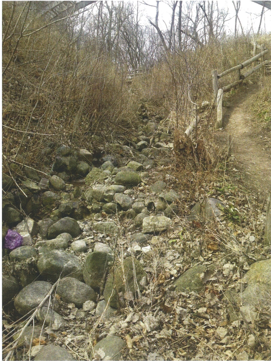
Proposed location of RSC in South Ravine w/ existing walking path (Photo taken 3/30/15)