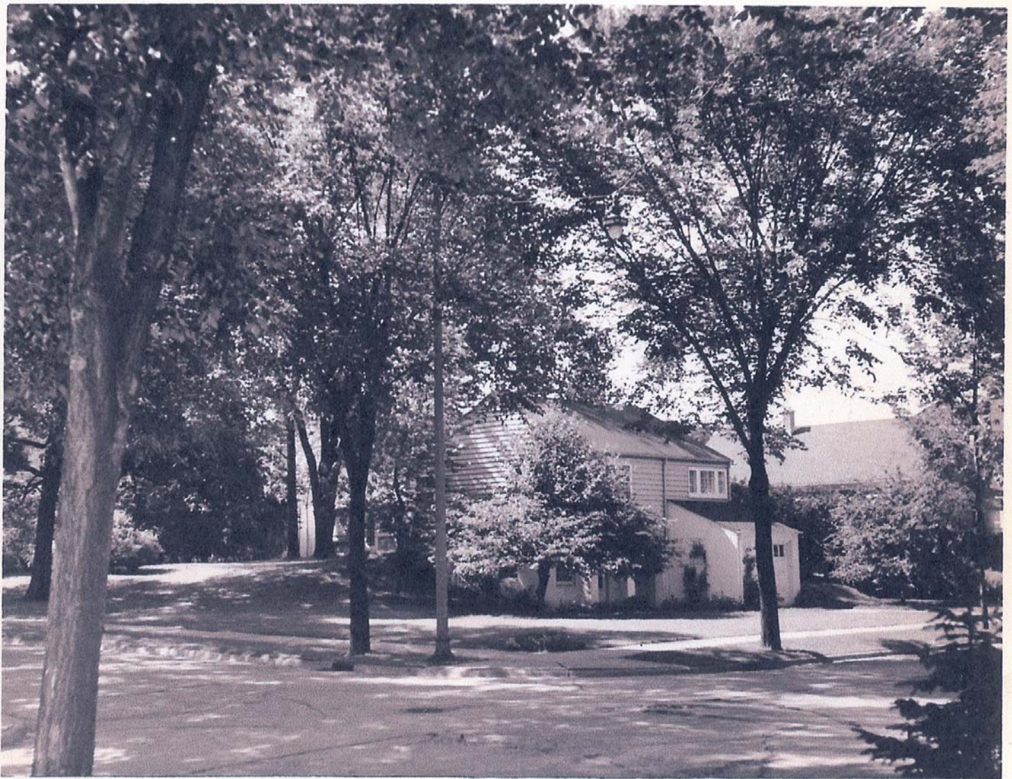
SIEVERS HOUSE IN 1959