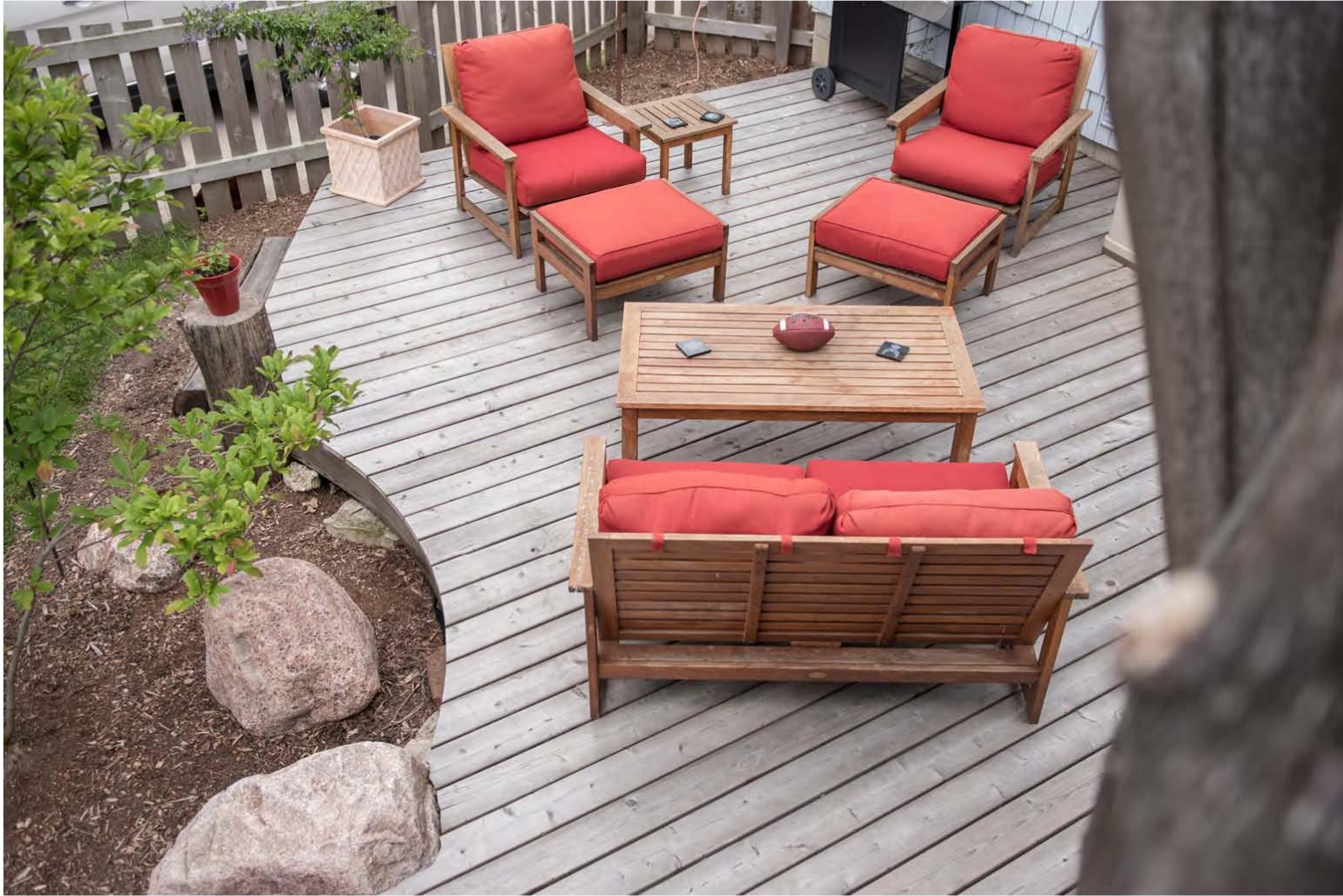
Example of Eco Wood Treatment applied to a cedar deck. www.ecowoodtreatment.com