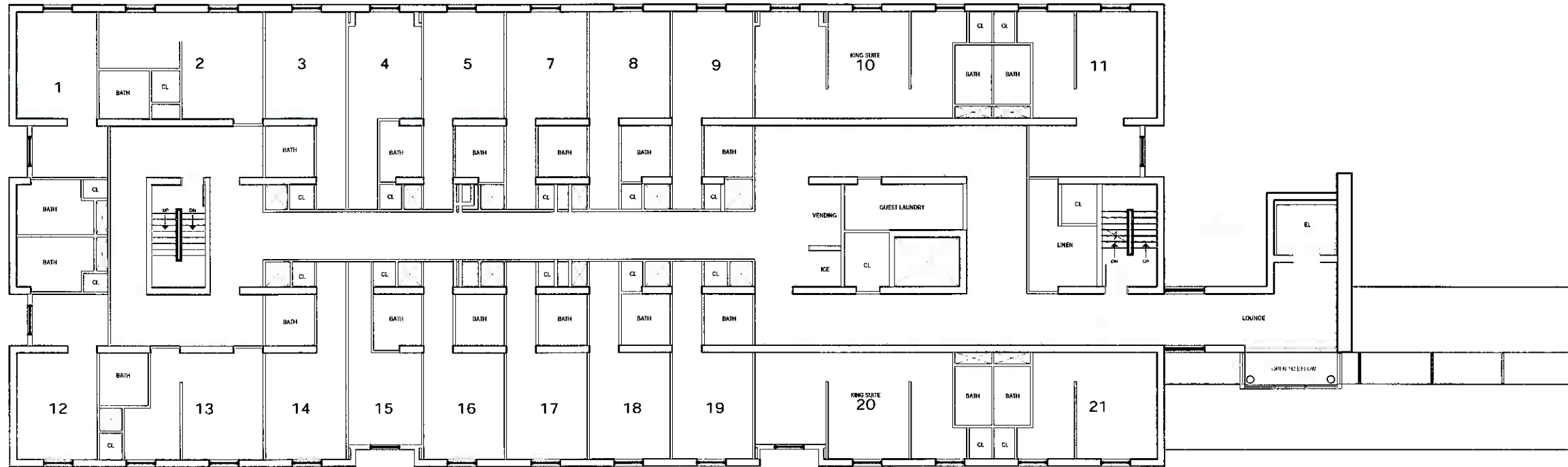
21 GUEST ROOMS LOUNGE