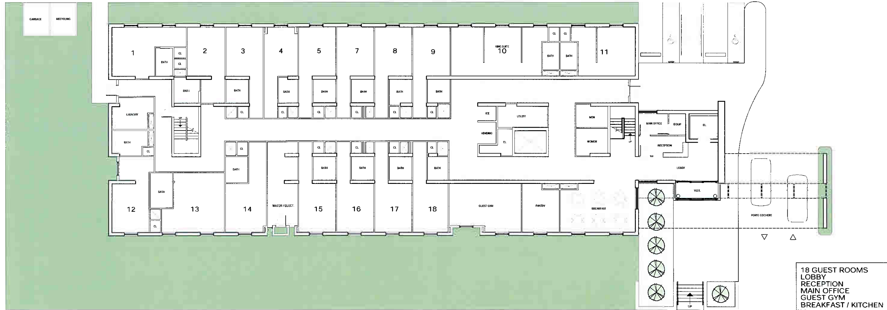
PROPOSED FIRST FLOOR PLAN 1/8" = 1'-0"