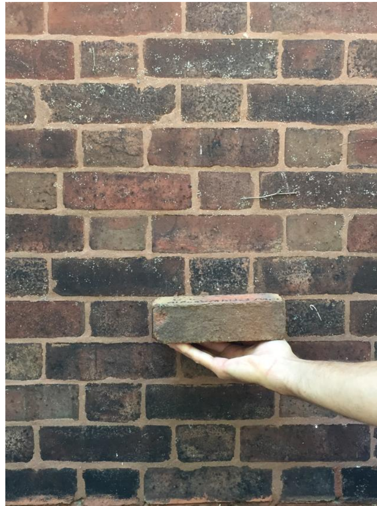
Detail images of (Left) the mortar sample, coursing sample (indicating Flemish bond) and (Right) brick to be utilized for infill at this location and for the reconstruction of the southern chimney