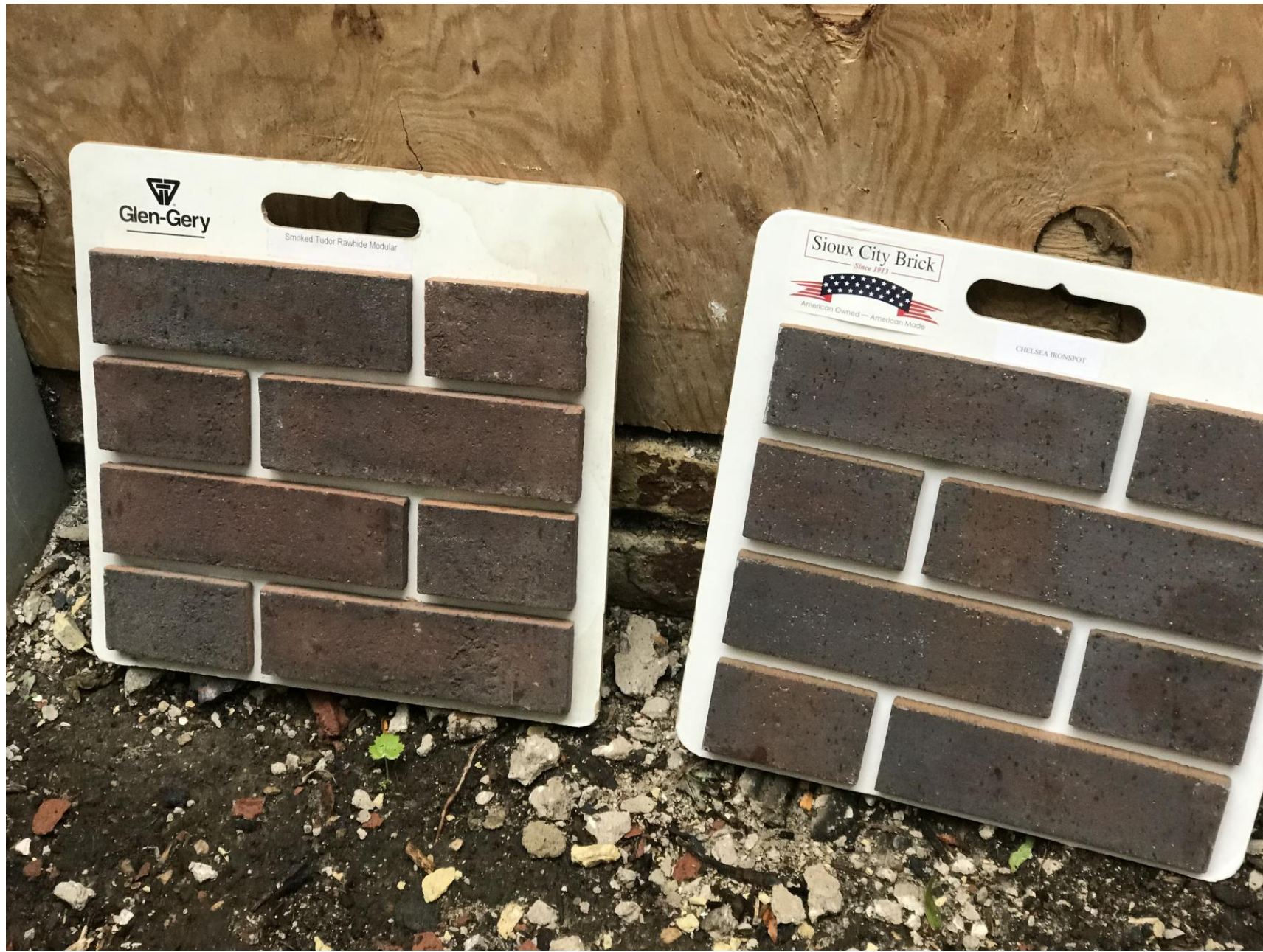
Glen Gery brick was discontinued before project could begin. Sioux City sample at right will substitute.