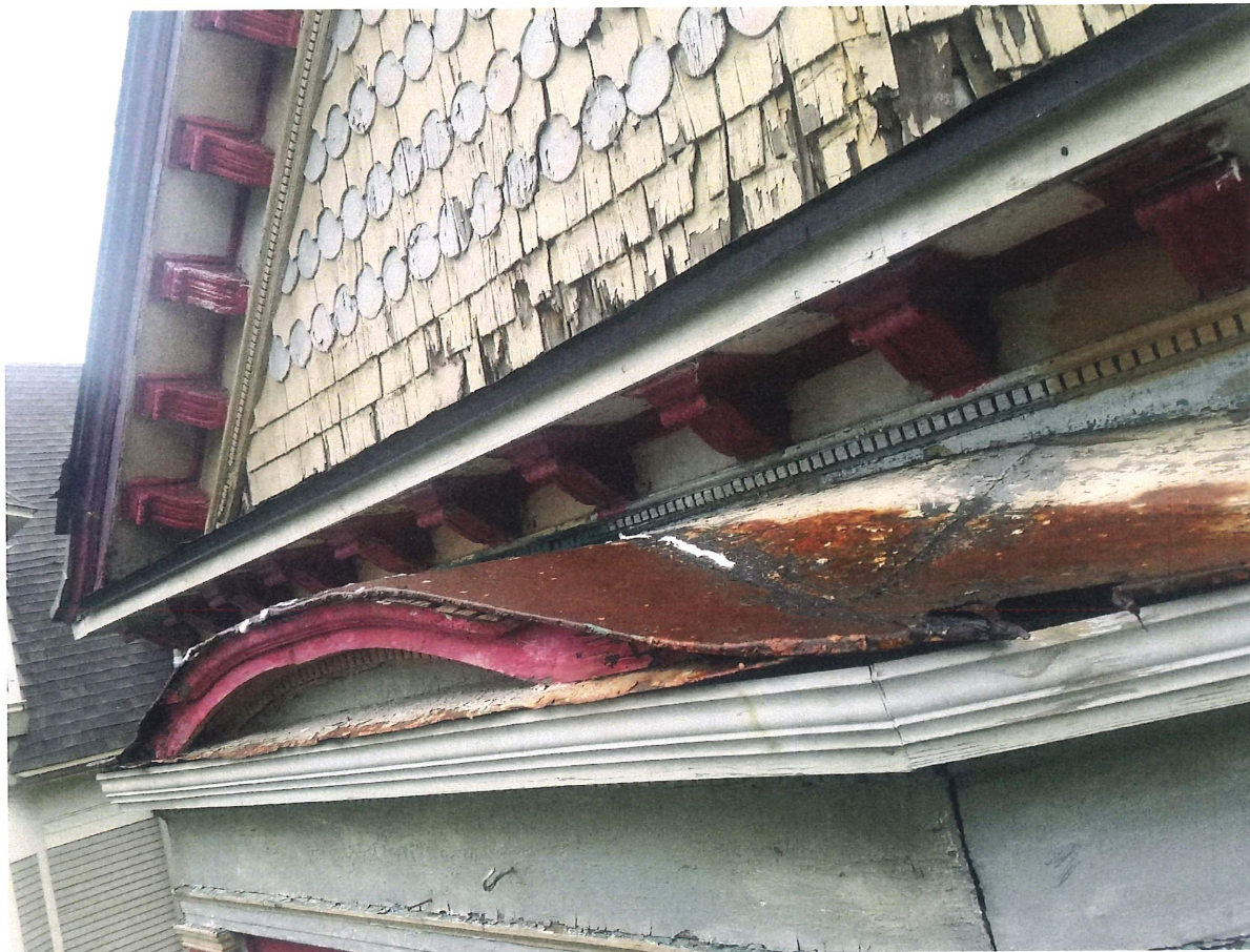
steel roof replaced