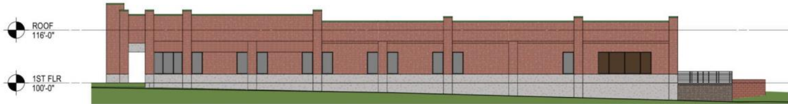
4 NORTH ELEVATION (COLOR) 1" = 20'-0"