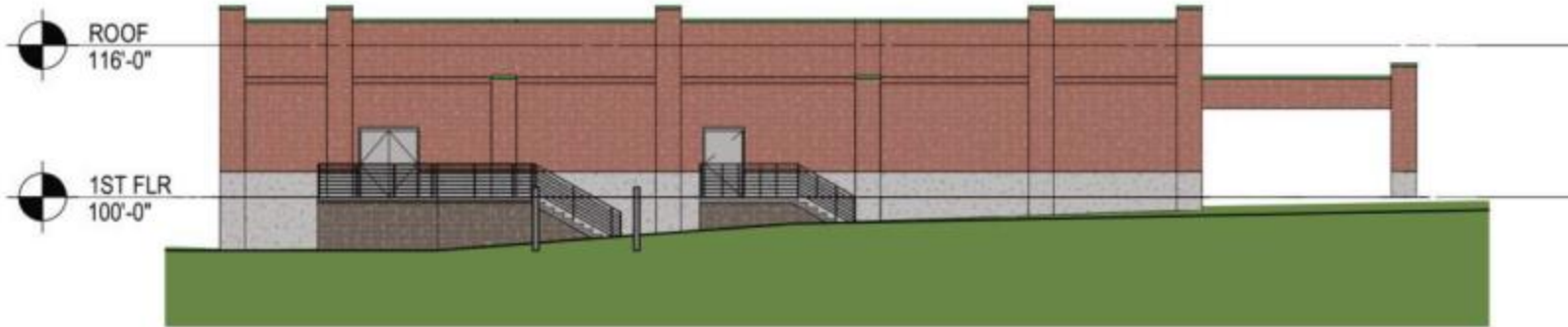
1 EXISTING WEST ELEVATION (COLOR) 1" = 20'-0"