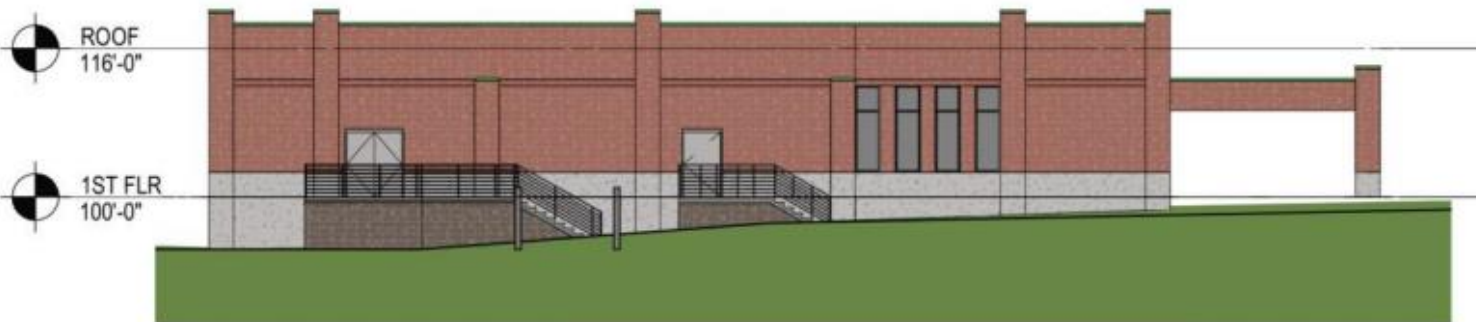
1 WEST ELEVATION (COLOR) 1" = 20'-0"