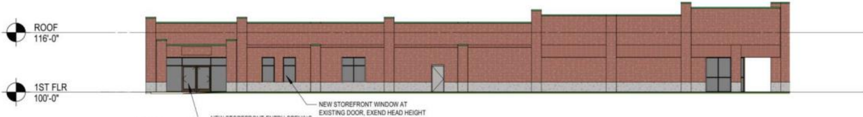
3 SOUTH ELEVATION (COLOR) 1" = 20'-0"