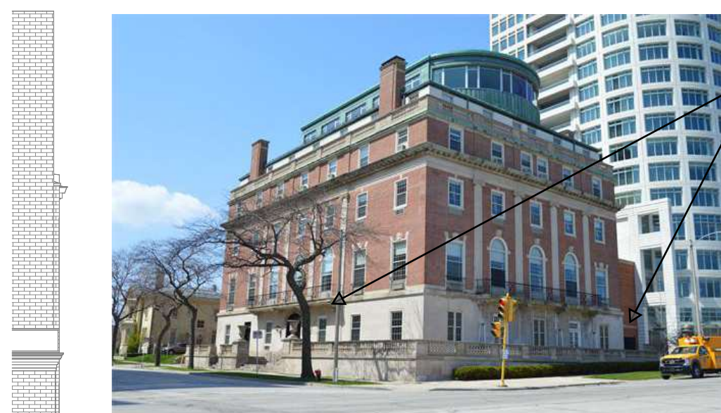
EXISTING - VIEW LOOKING NORTHWEST