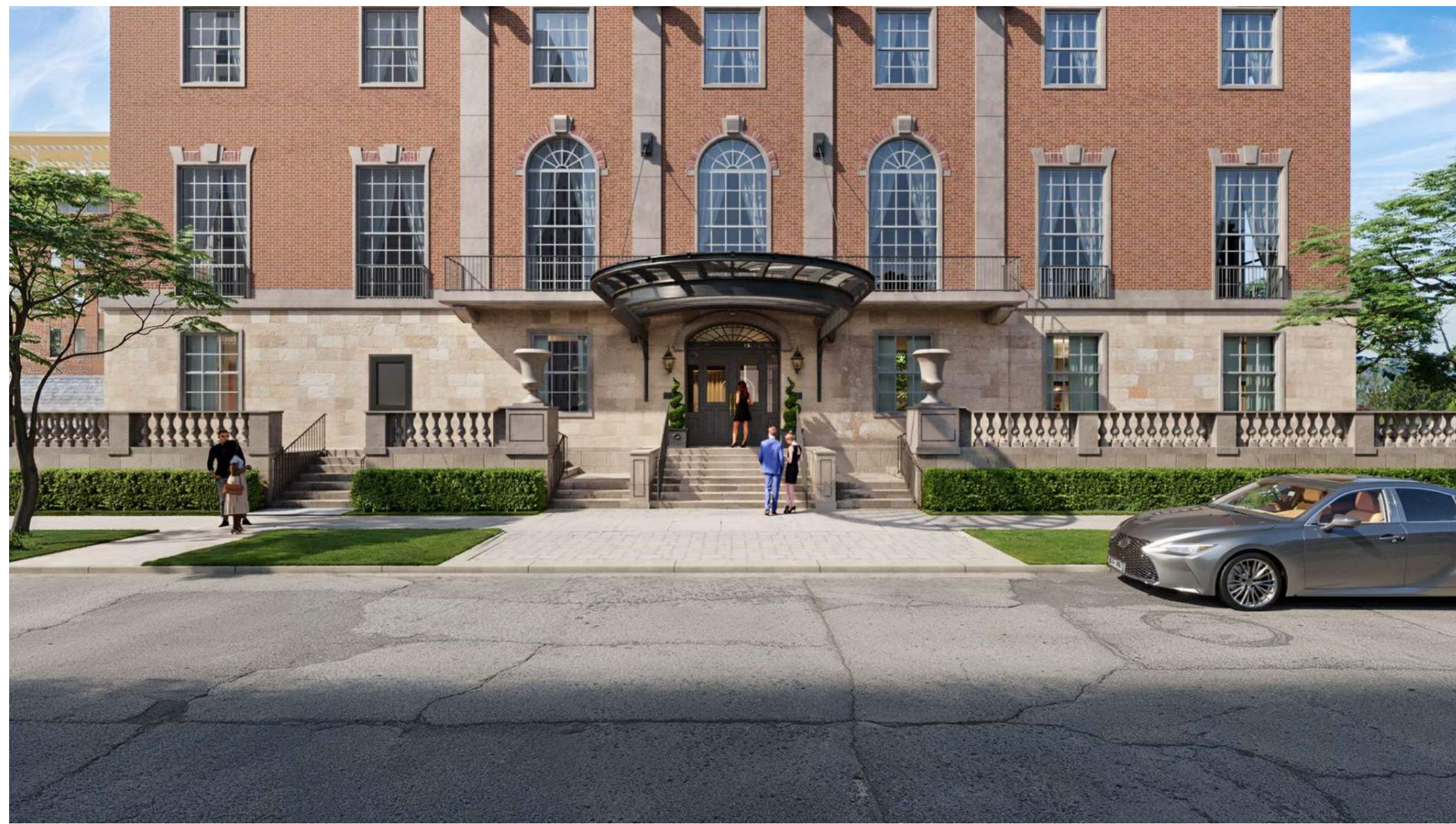
WELLS ENTRY CANOPY - VIEW LOOKING NORTH

PROPOSED OVERALL DIMENSIONS OF LOADING ENTRANCE CANOPY - METAL PANEL TO MATCH FINISH OF AESS ENTRY CANOPIES