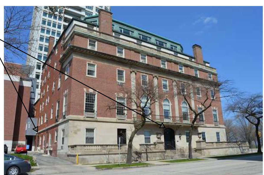
EXISTING - VIEW LOOKING NORTHEAST