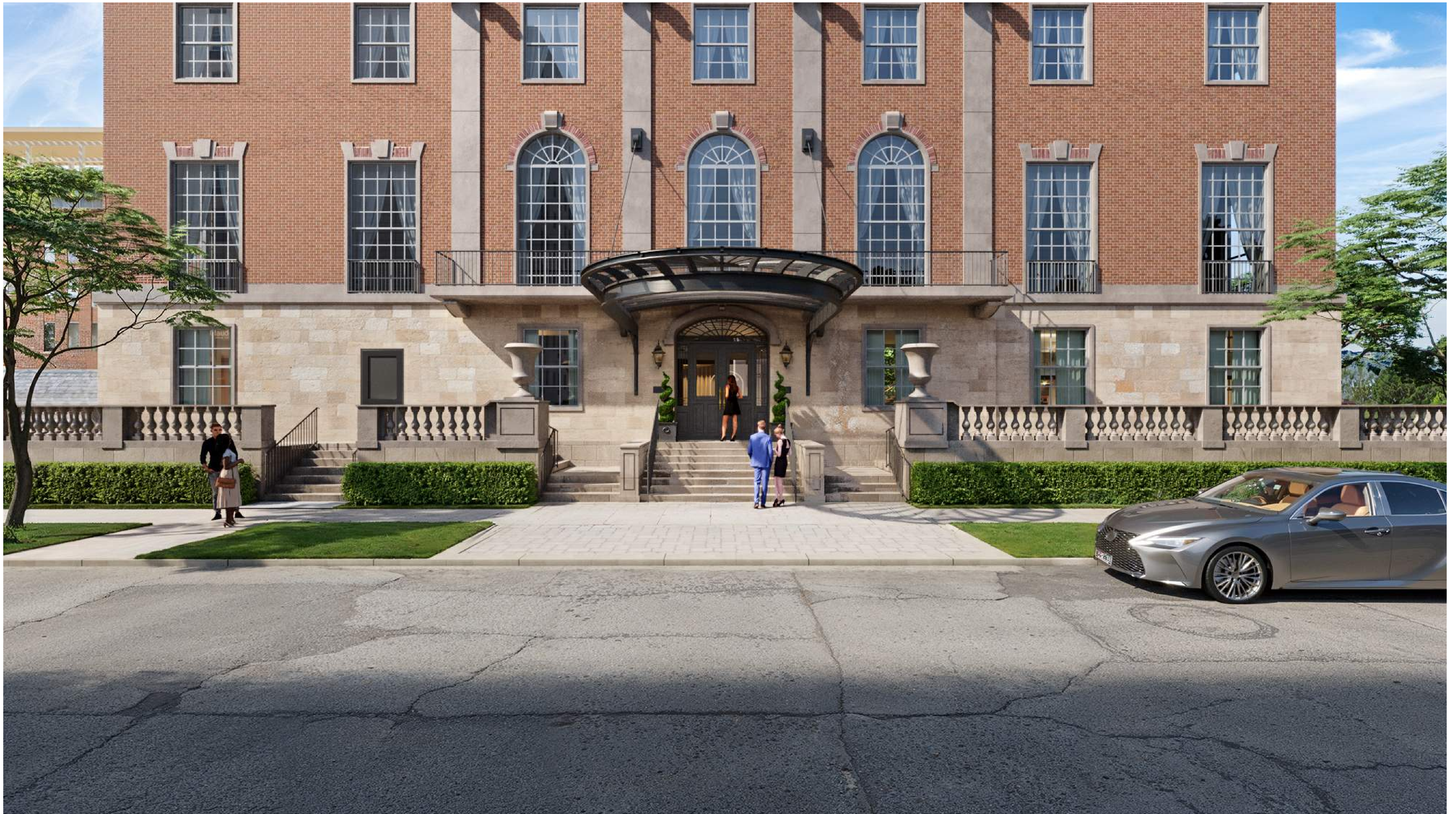
WELLS ENTRY CANOPY - VIEW LOOKING NORTH