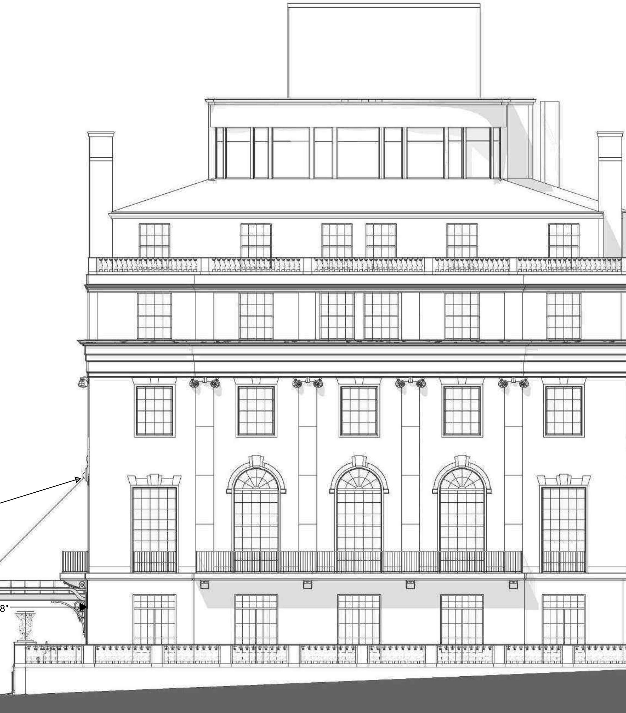
1 EXTERIOR ELEVATION - COA - EAST 1/8" = 1'-0"

TIEBACK SUPPORTS ATTACHED TO EXISTING STRUCTURE