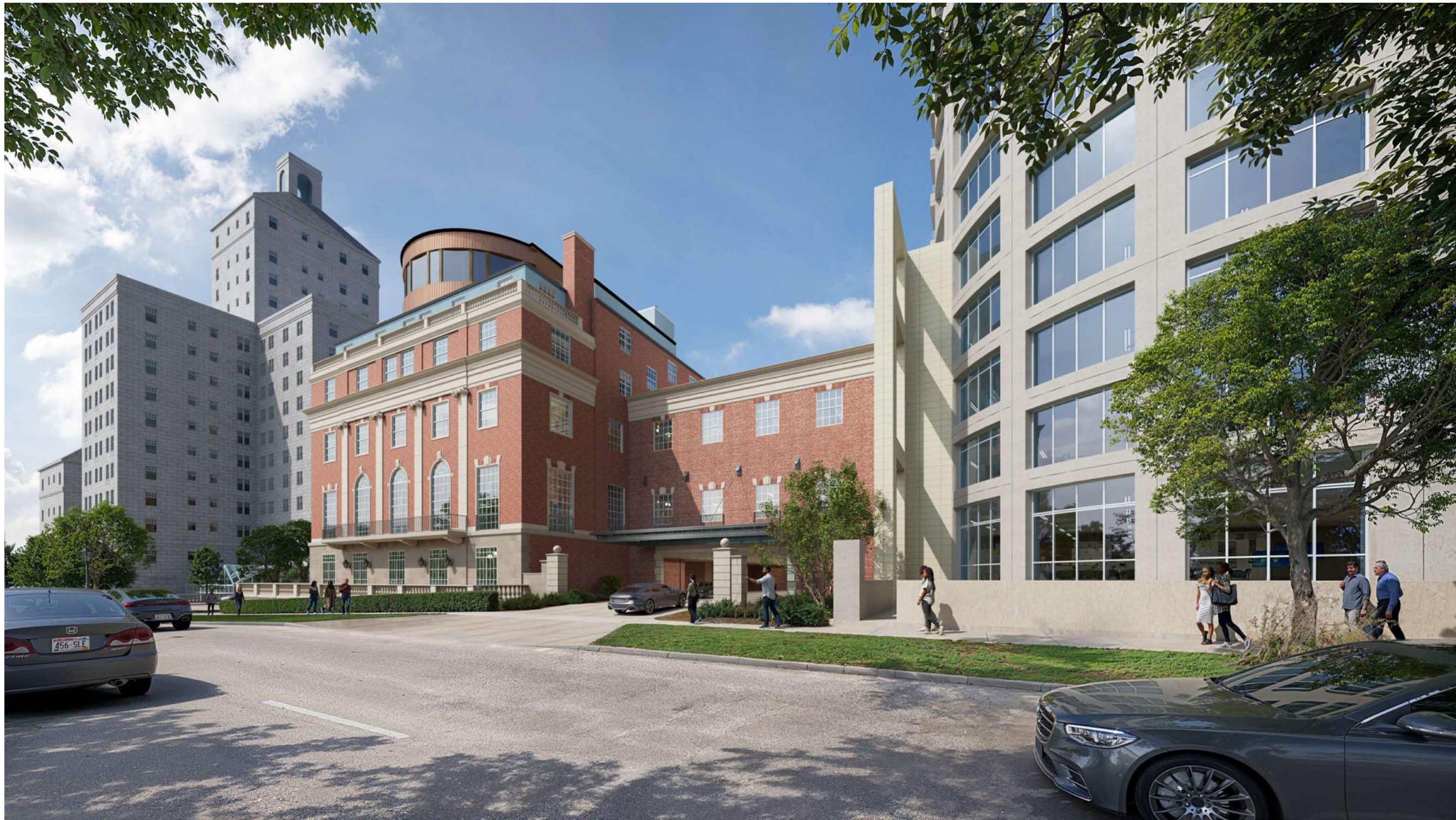
PROSPECT PORTE-COCHÈRE CANOPY - VIEW LOOKING SOUTHWEST