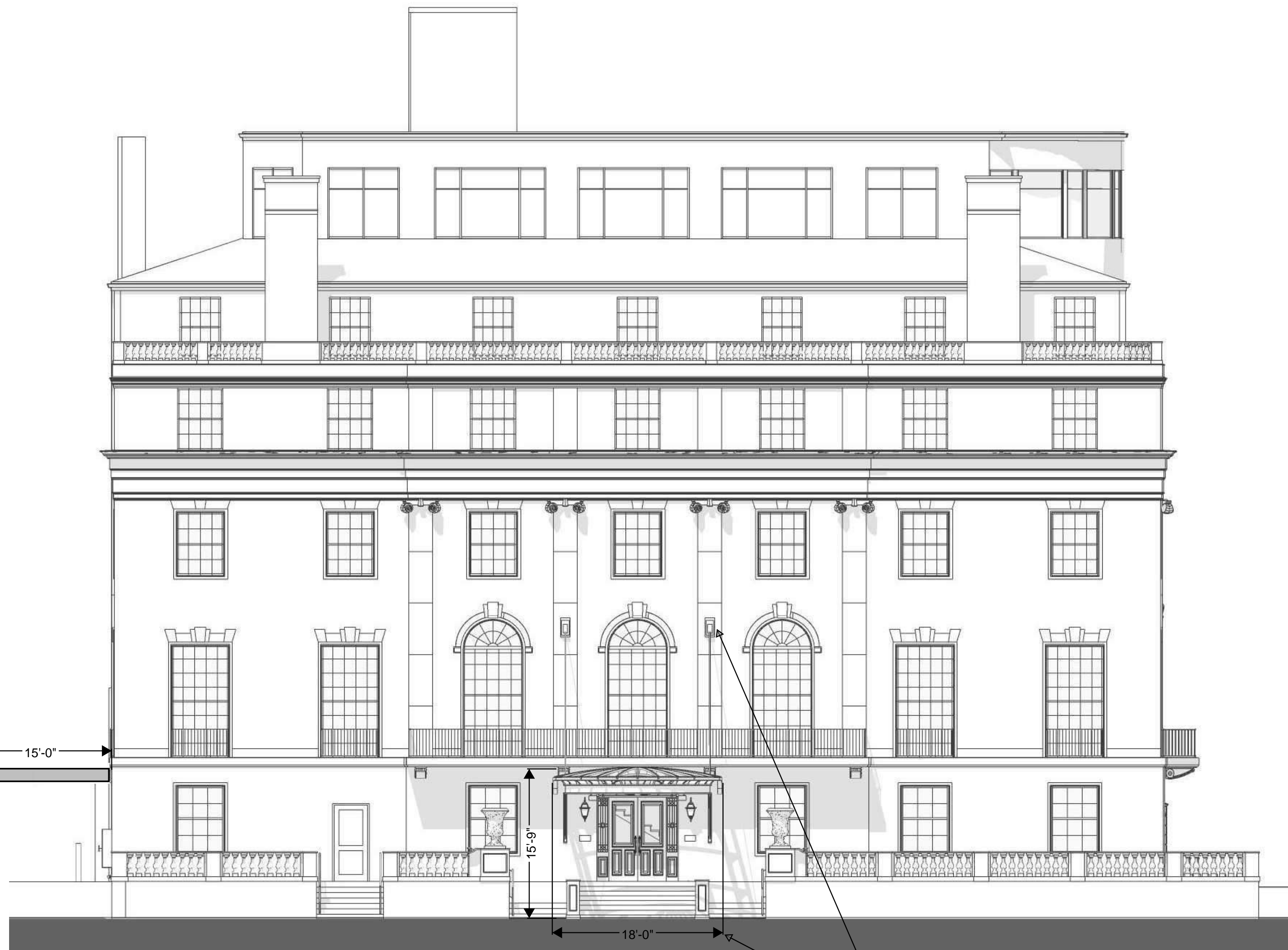
2 EXTERIOR ELEVATION - COA - SOUTH 1/8" = 1'-0"

TIEBACK SUPPORTS ATTACHED TO EXIST STRUCTURE