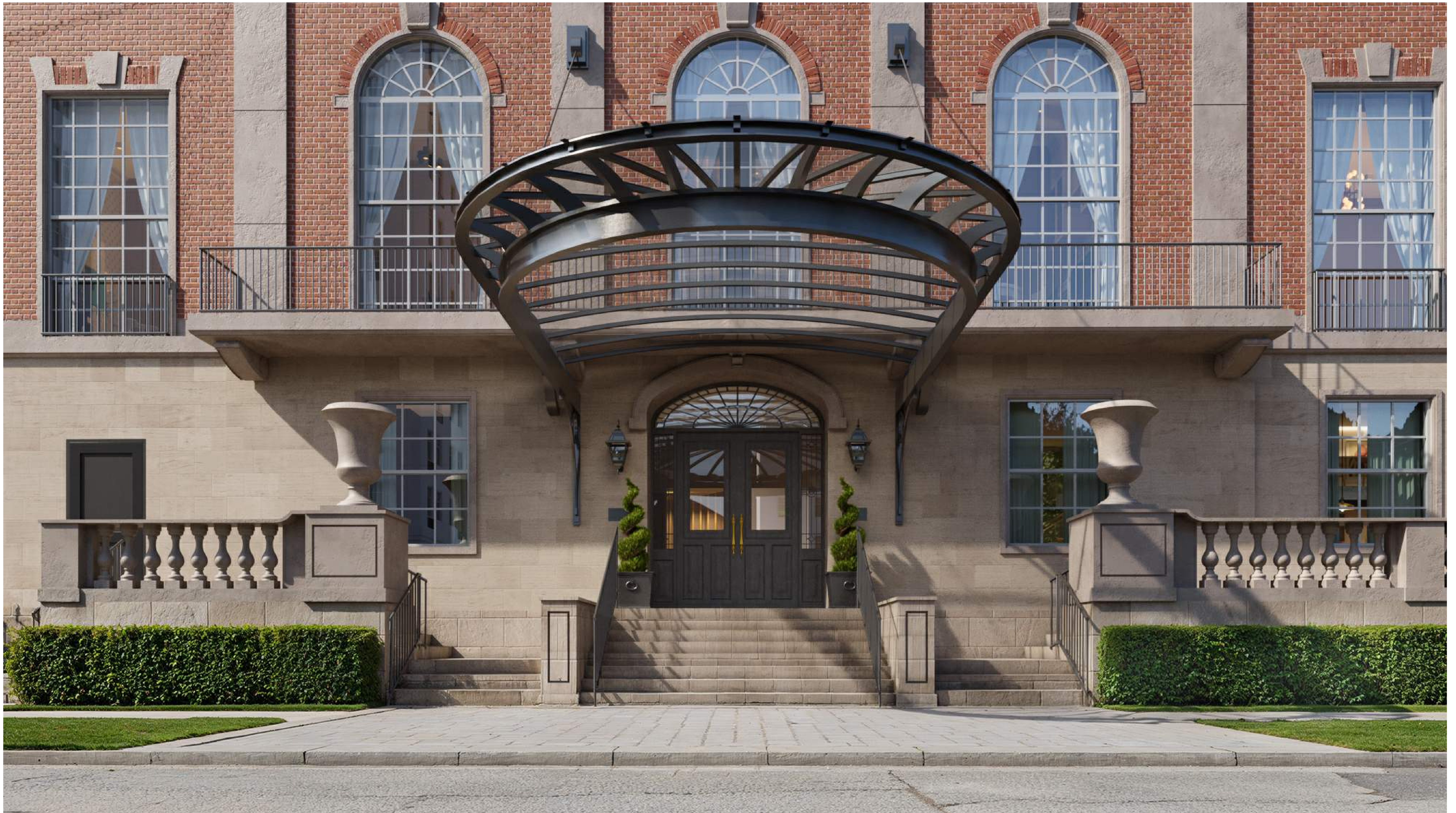
WELLS ENTRY CANOPY - VIEW LOOKING NORTH