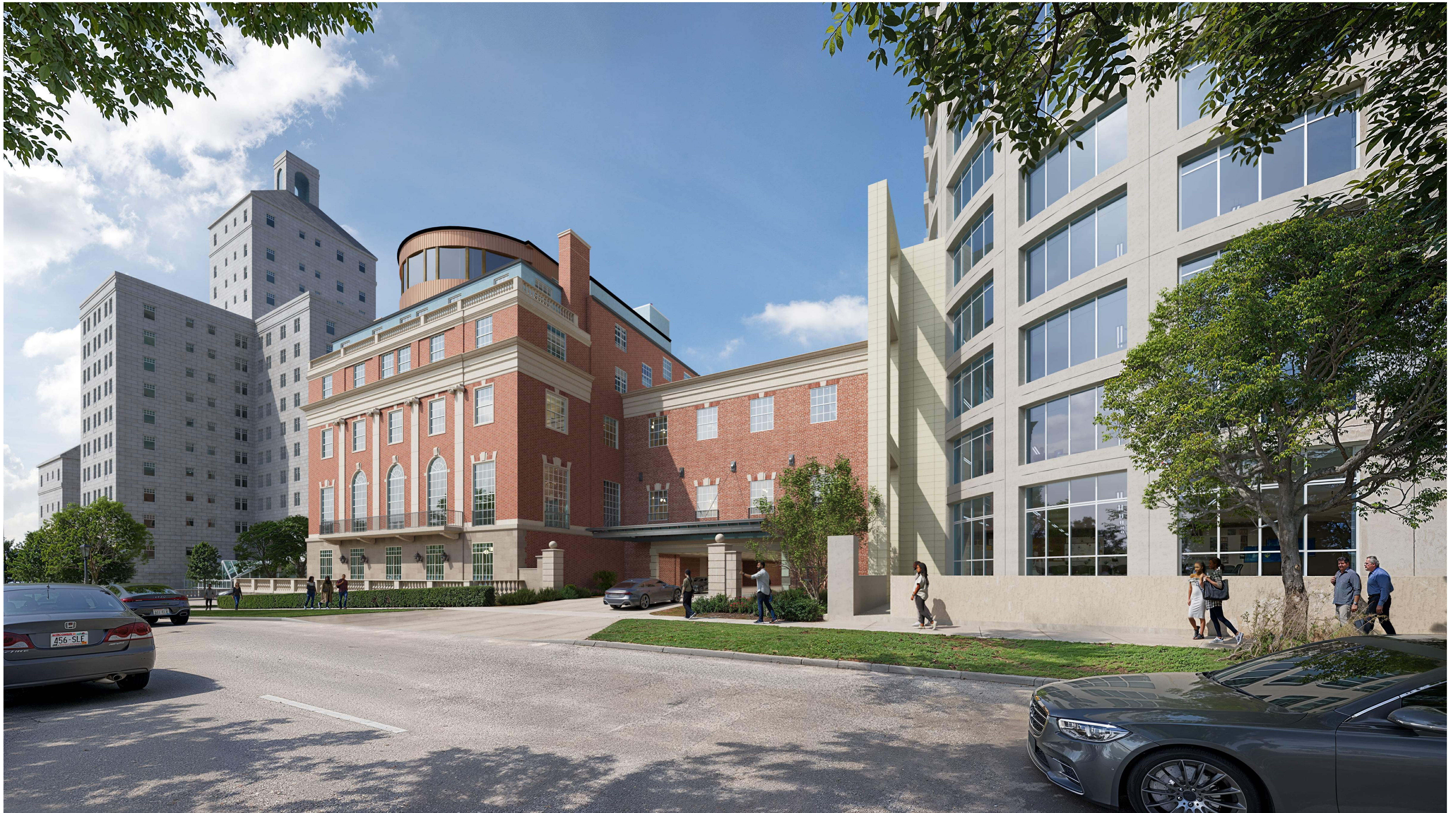
PROSPECT PORTE-COCHÈRE CANOPY - VIEW LOOKING SOUTHWEST