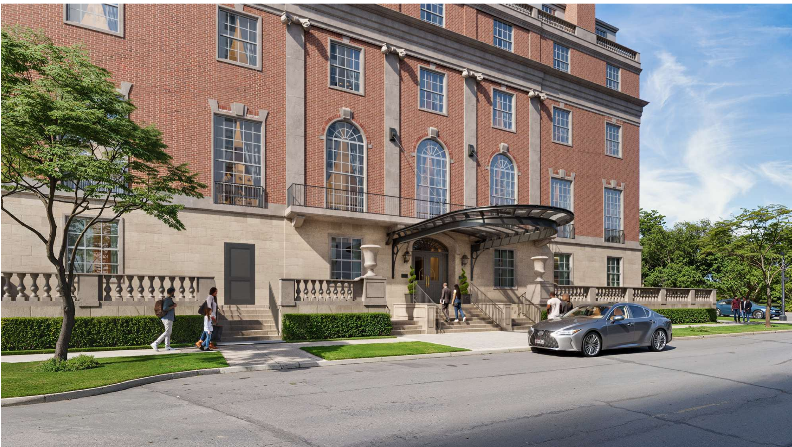
WELLS ENTRY CANOPY - VIEW LOOKING NORTHEAST