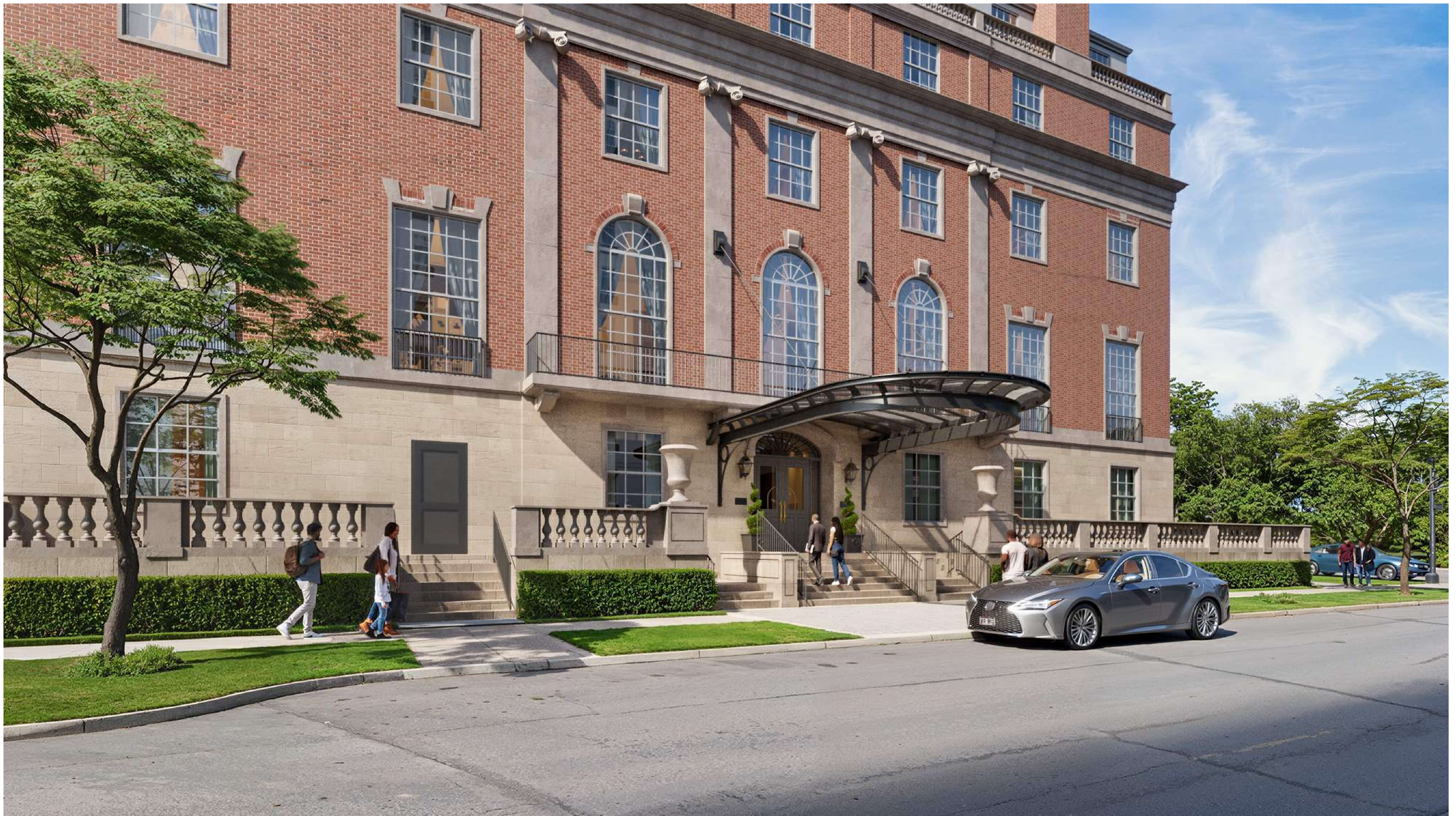
WELLS ENTRY CANOPY - VIEW LOOKING NORTHEAST