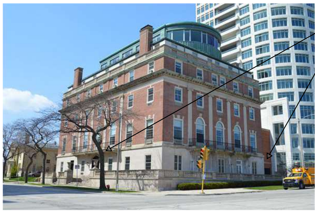
EXISTING - VIEW LOOKING NORTHWEST