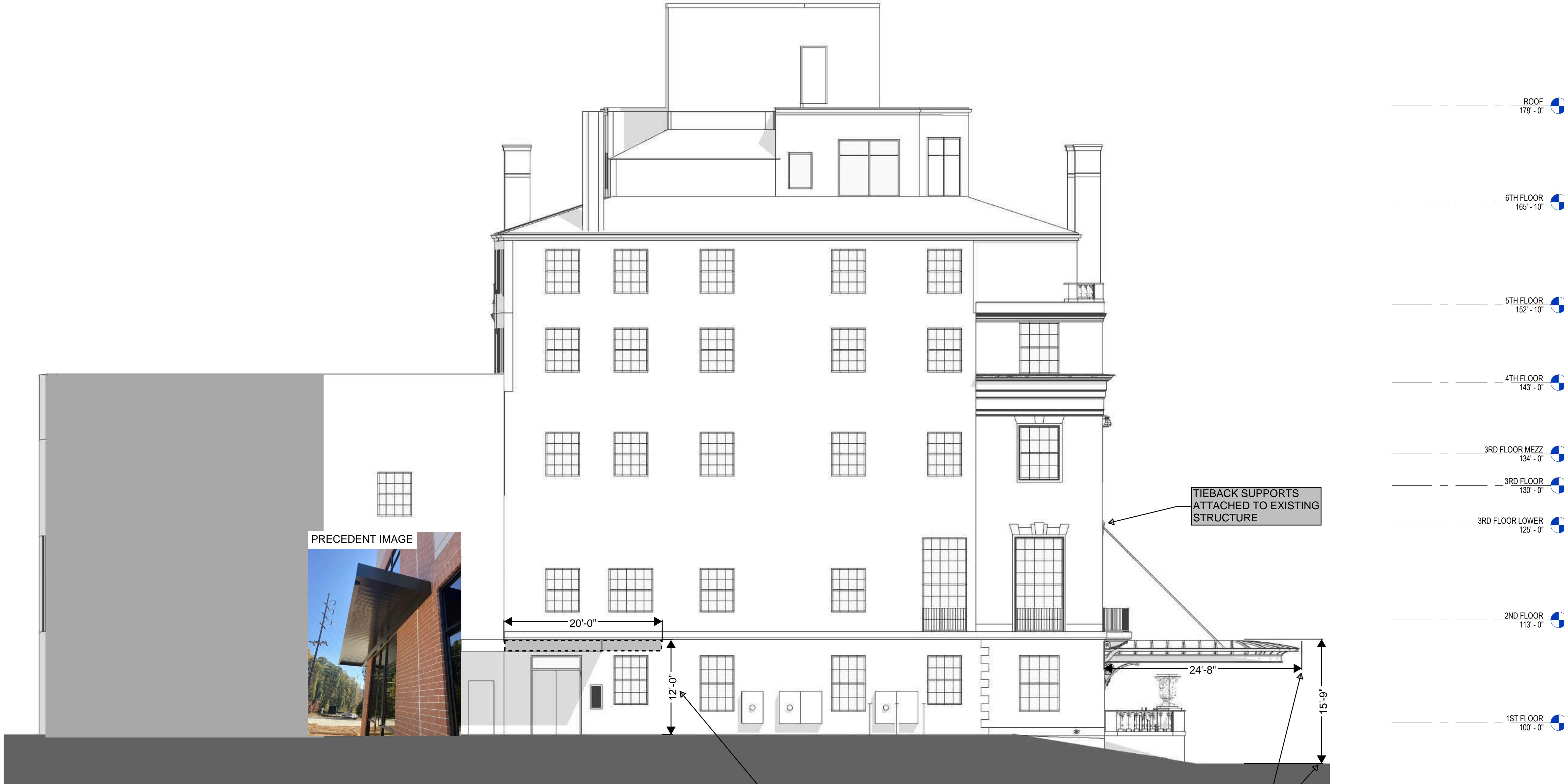
1 EXTERIOR ELEVATION - COA - WEST 1/8" = 1'-0"