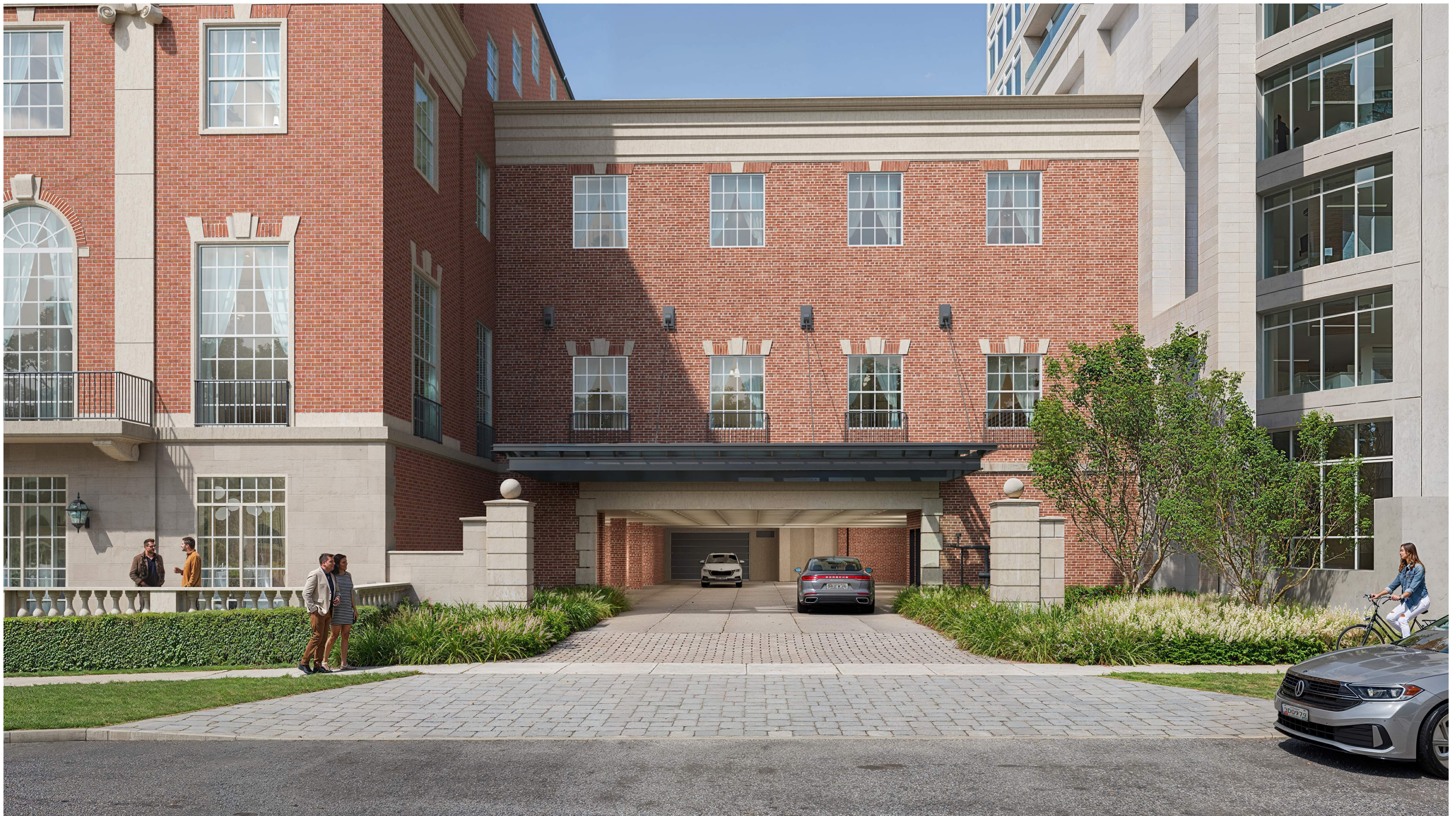
PROSPECT PORTE-COCHÈRE CANOPY - VIEW LOOKING WEST