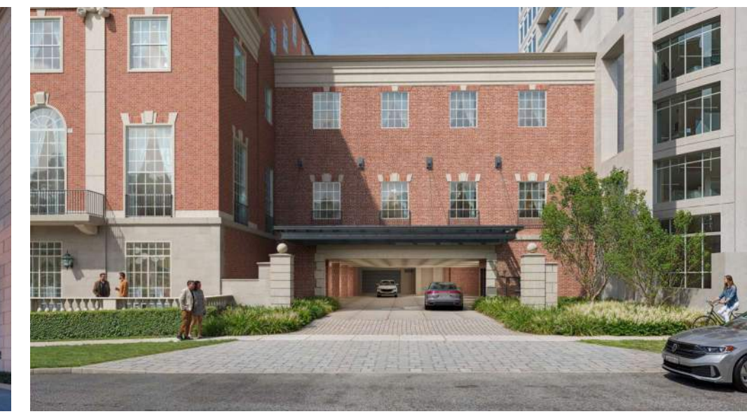
PROSPECT PORTE-COCHÈRE CANOPY - VIEW LOOKING WEST

HEIGHT OF NEW ADDITION - CLAY FACE BRICK BLEND TO MATCH PREVIOUSLY APPROVED AND EXECUTED COA SCOPE