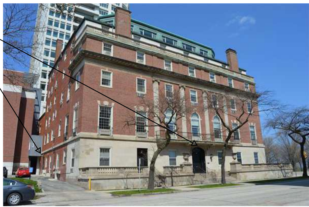
EXISTING - VIEW LOOKING NORTHEAST