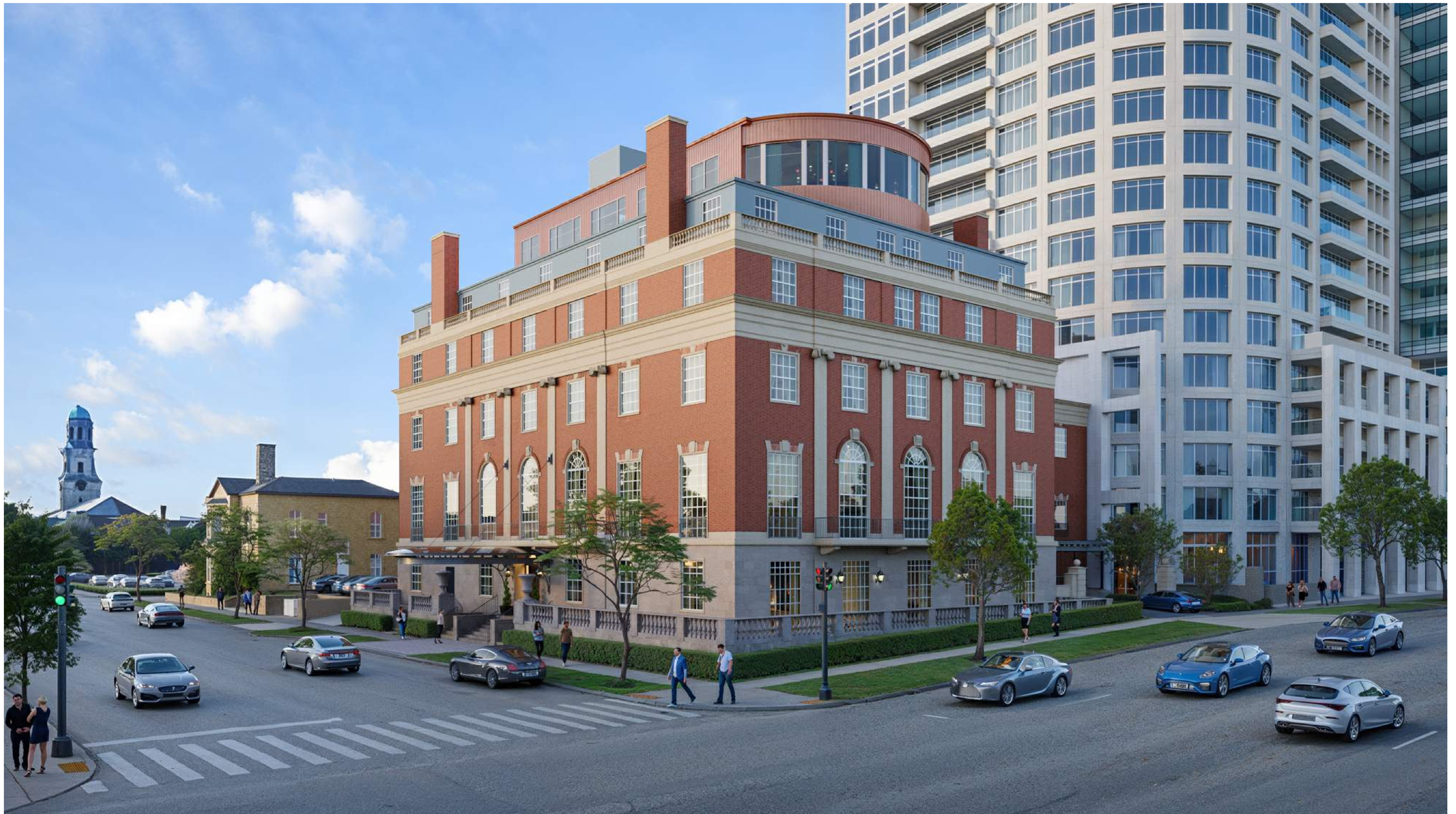
SOUTHEAST CORNER OF WELLS AND PROSPECT - VIEW LOOKING NORTHWEST