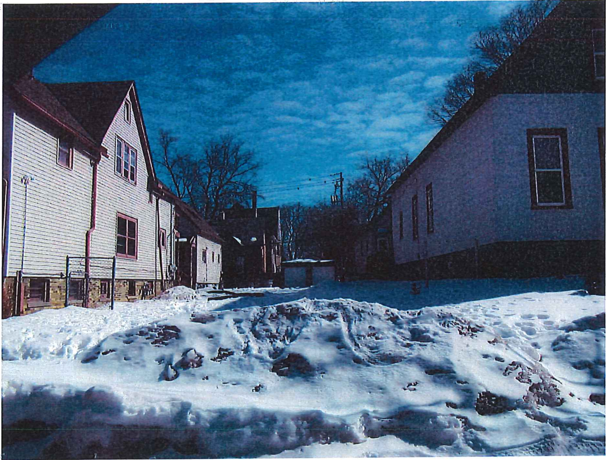
2432 N Weil Street – Vacant Lot