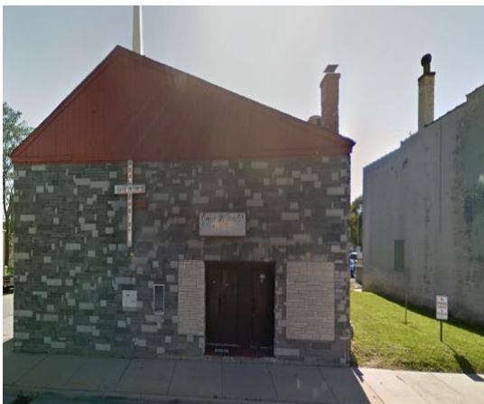
2601 West North Avenue (front view)

2601-05 West North Avenue, a vacant church having approximately 3,084 square feet and was acquired through property tax foreclosure in 2013 and 2609-11 West North Avenue, a vacant lot was acquired through property tax foreclosure in 2011. The improved parcel and vacant lot that together (the "Properties") have a combined lot area of approximately 9,996 square feet.