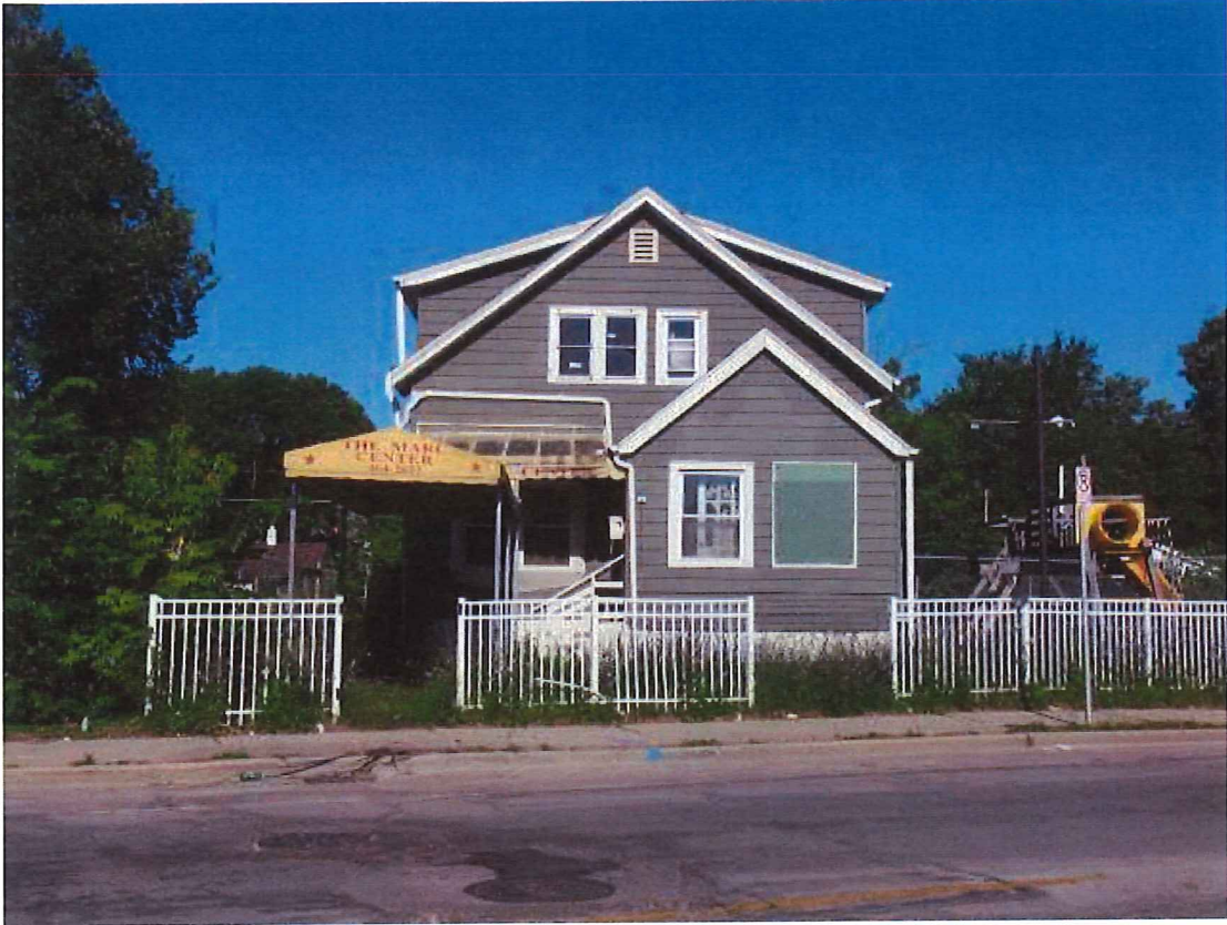
4843 N Hopkins Street