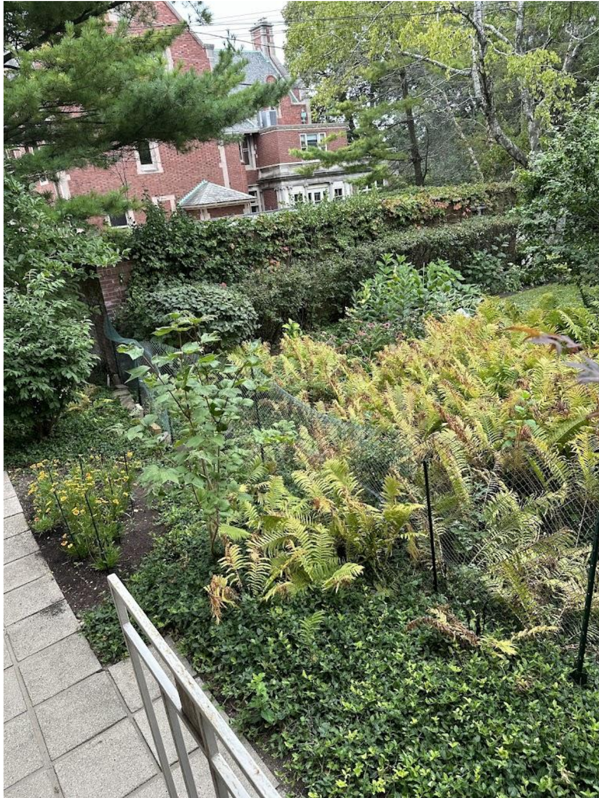
View from back porch of house, looking southeast. This is where the “3’-6” Tall Mesh Fence” will be installed, to protect historic borrowed view. This border cannot be seen from the street