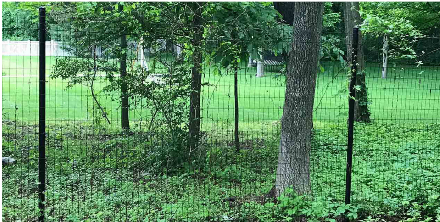
3'-6" Tall Mesh Fence