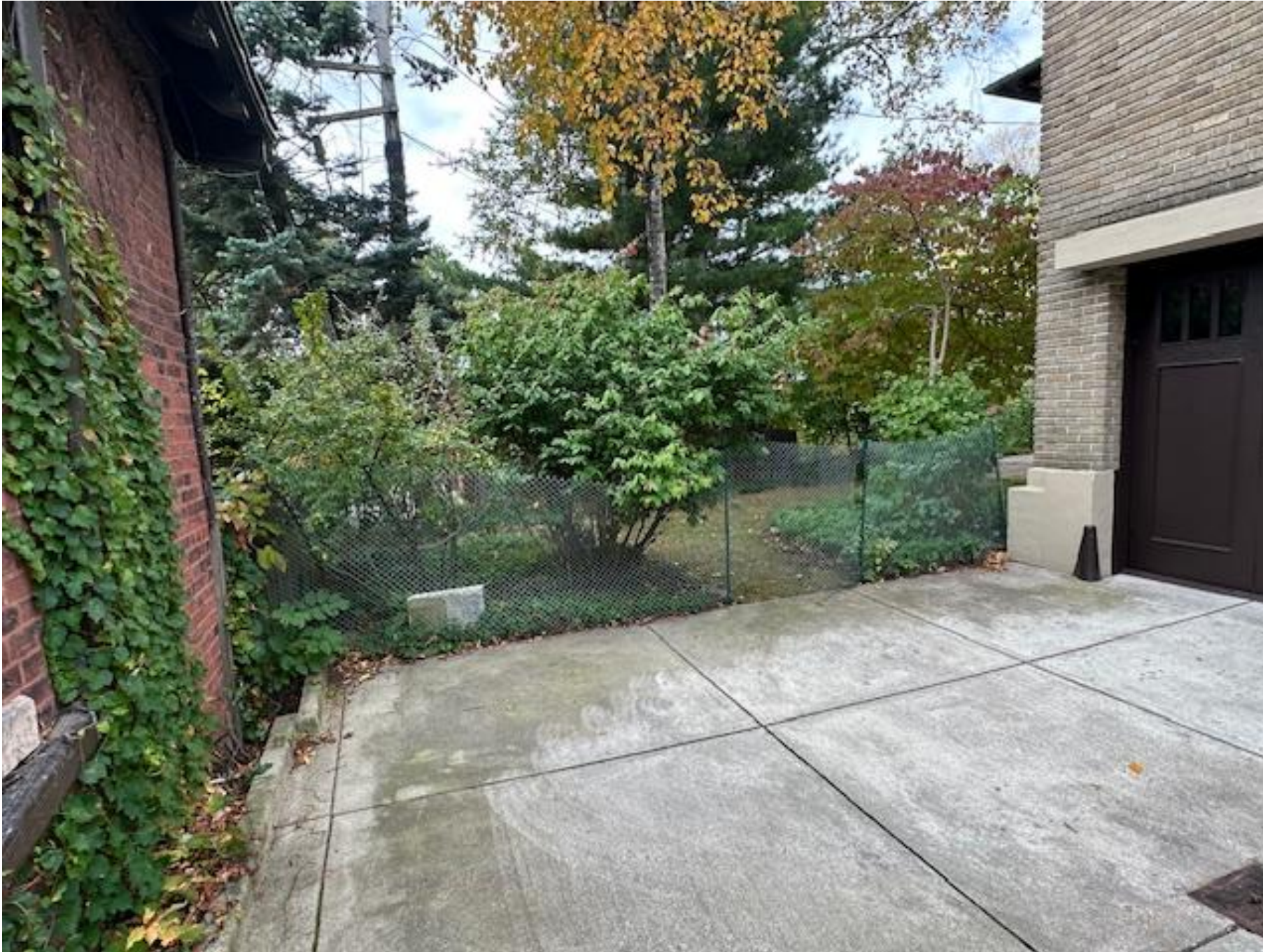
Back driveway looking south. Obscured from street by house and garage. Privacy fence will be installed as the image "6'-0" Tall Privacy Fence"