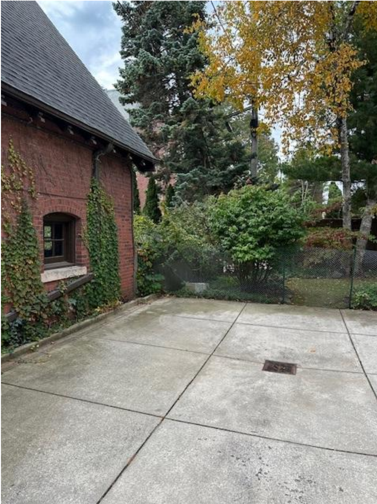
Substantially similar view as above. Looking southeast from back driveway. Again, cannot be viewed from the street.