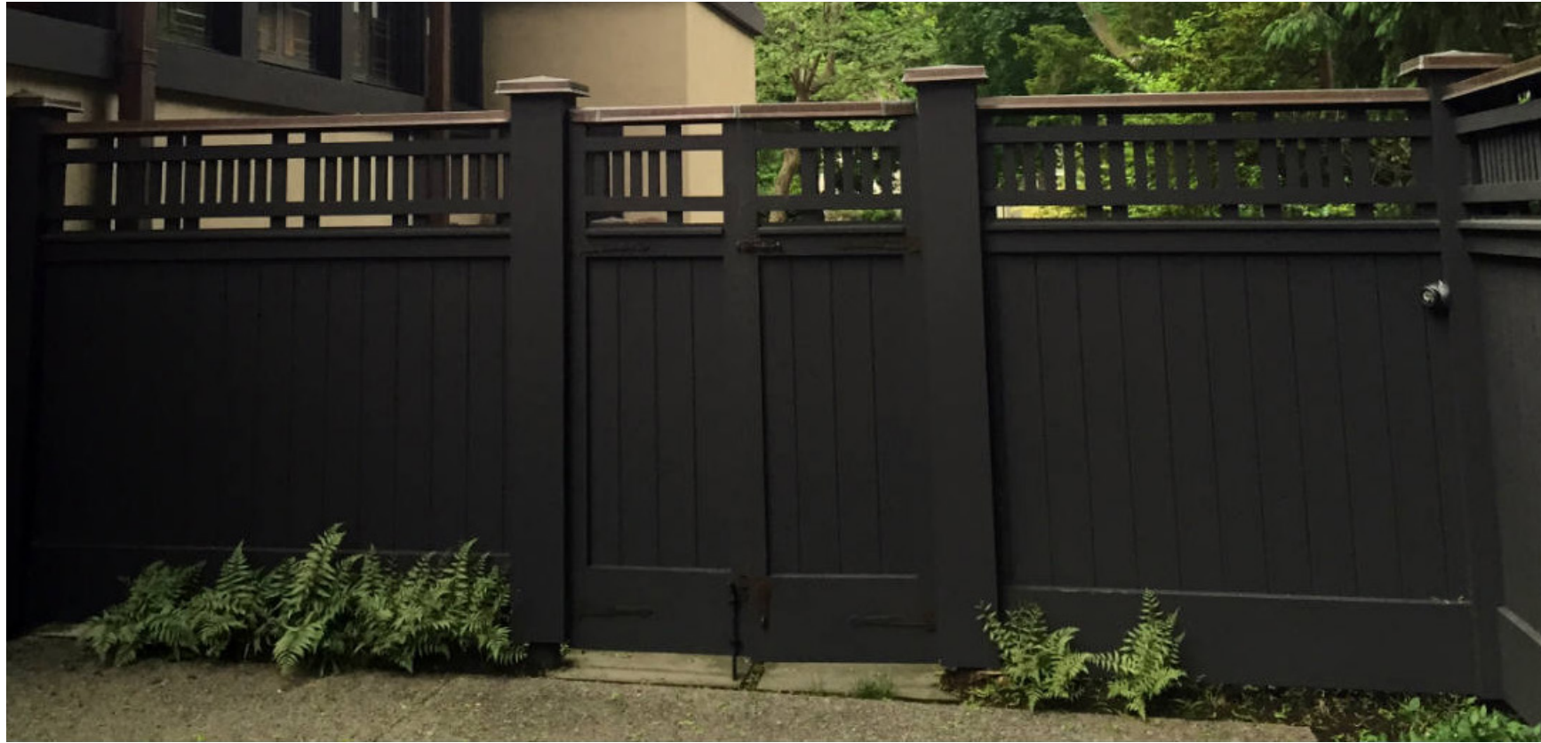
6'-0" Tall Privacy Fence