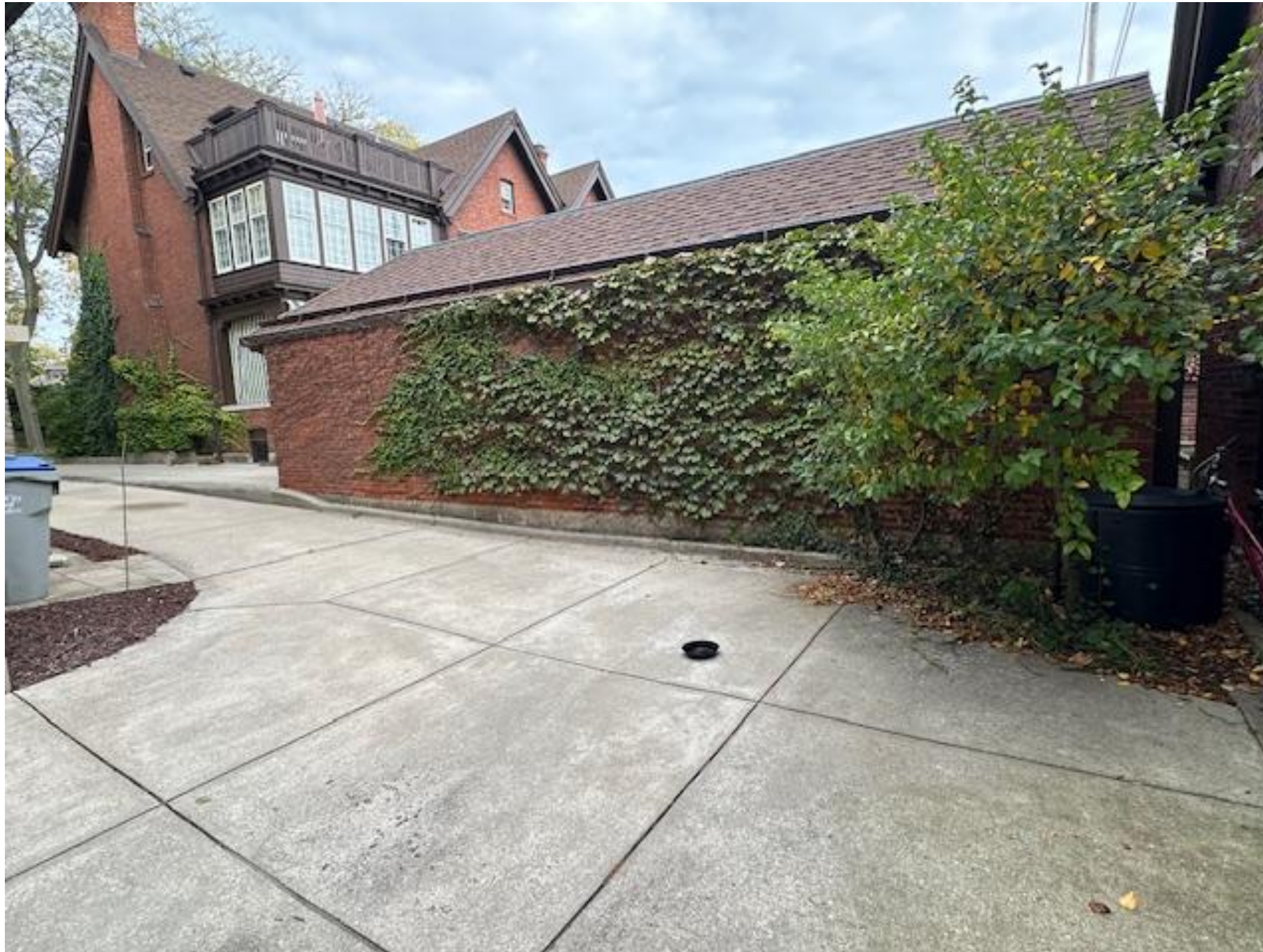
From back driveway looking north. No changes to this view