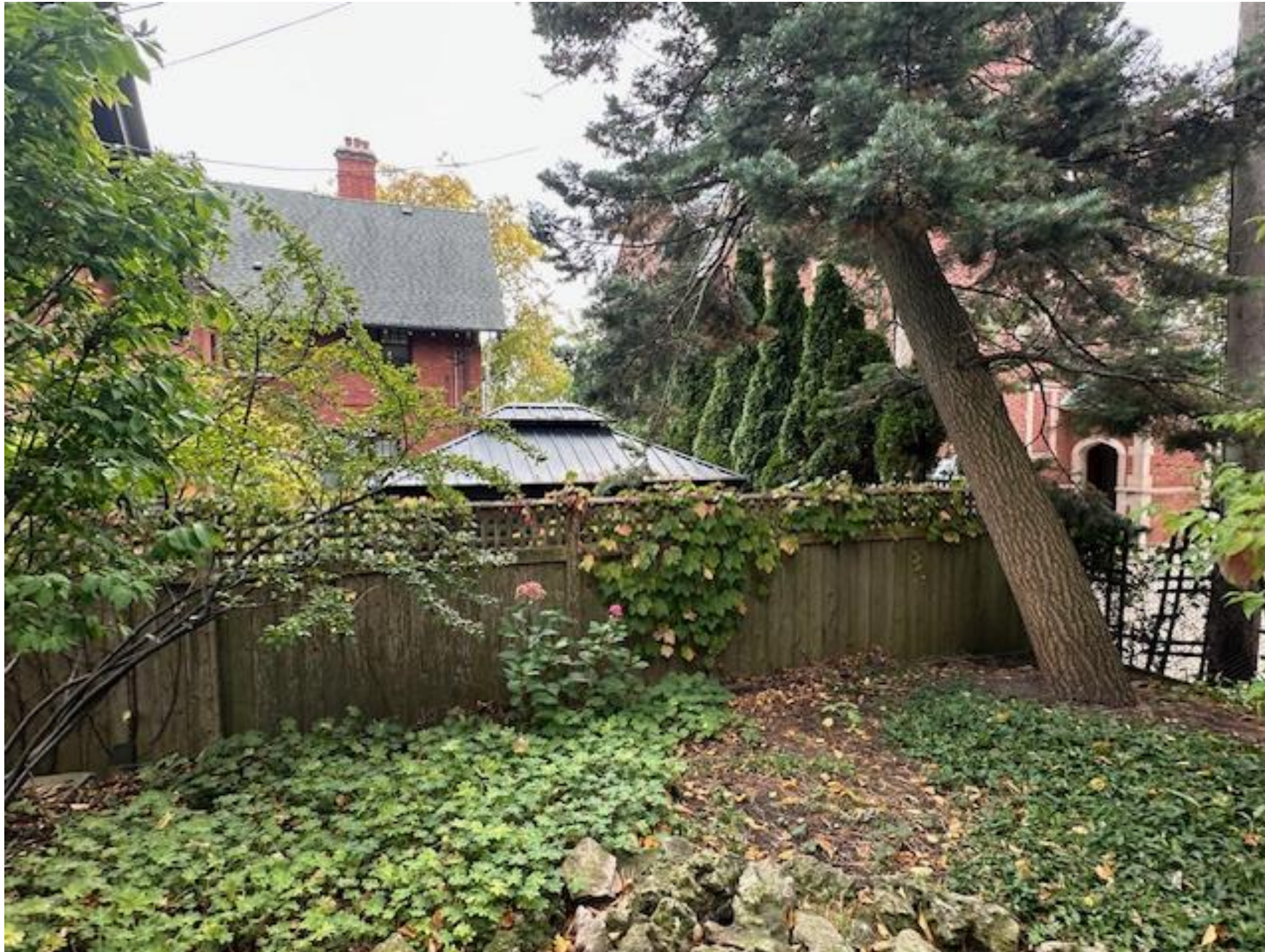
Looking east to existing neighbor's fence. To be replaced by the fence in the image above, labeled "6'-0" Tall Privacy Fence"