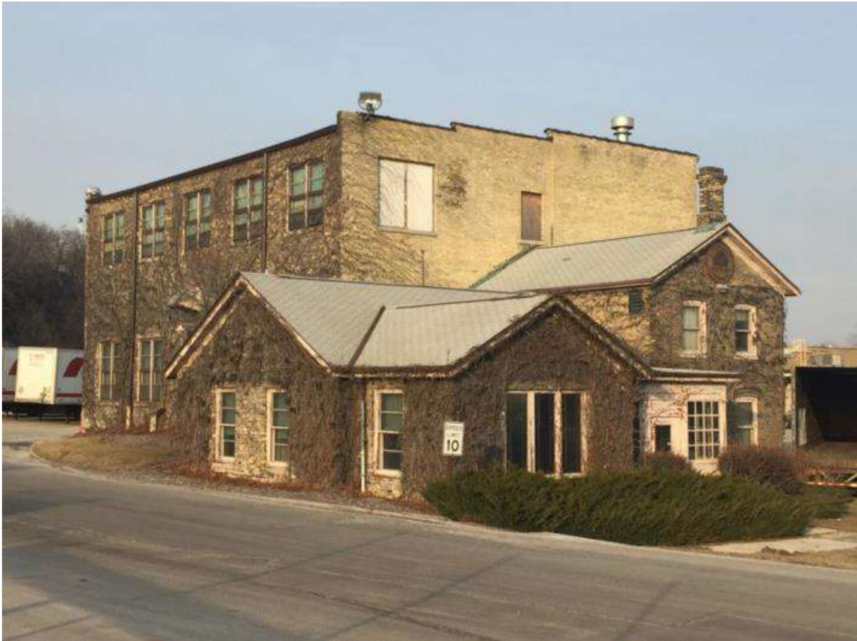
Current site conditions. Two-story building may not be demolished.