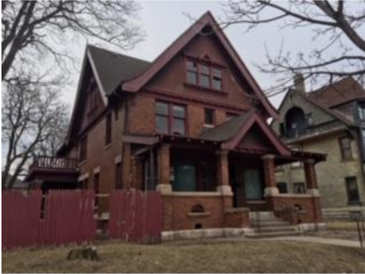
Condition before project. Balcony railing was absent at time of purchase.