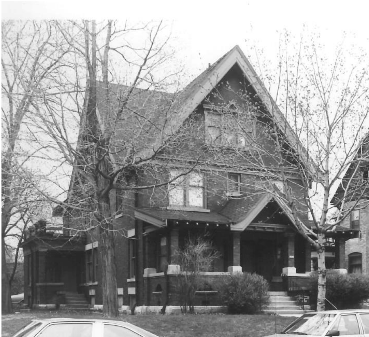
1983 photo showing historic state of east balcony railing. Posts will be reproduced in wood. Additional posts will be added to north and south sides of balcony, if necessary to meet current building code.