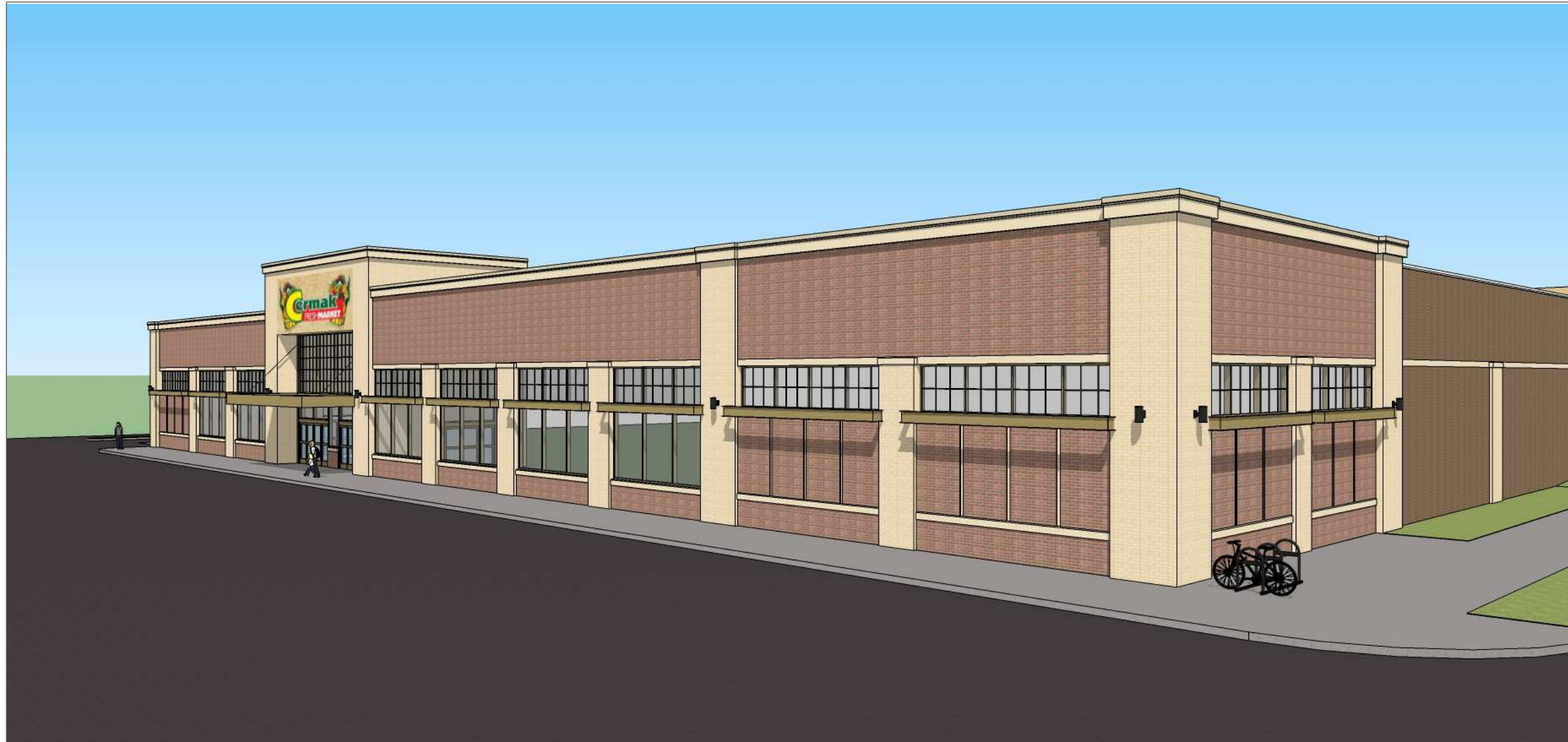
FRONT VIEW FROM NW

PROPOSED CERMAK AT FRESHWATER PLAZA 1st AND GREENFIELD MILWAUKEE, WI