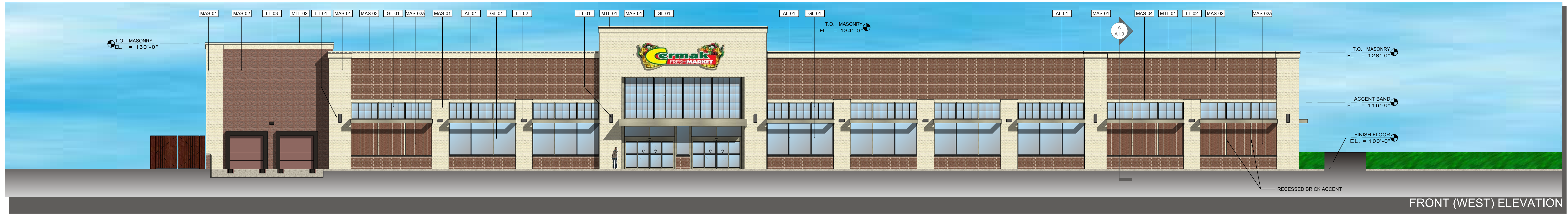
FRONT (WEST) ELEVATION