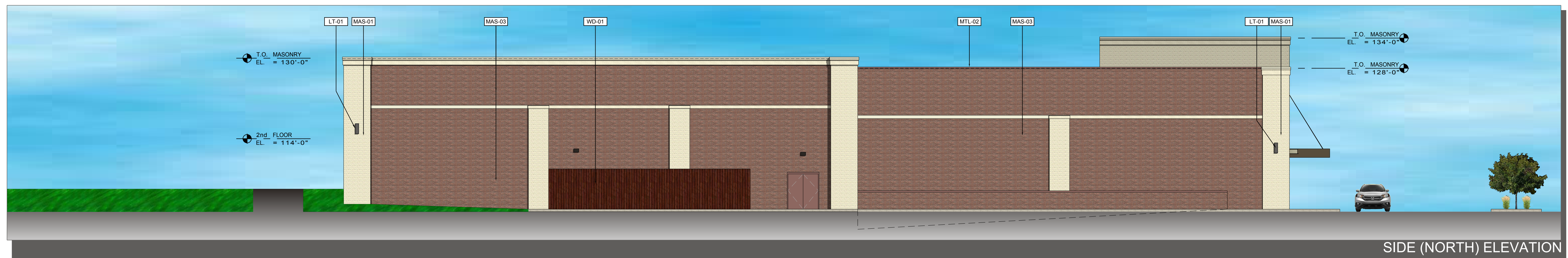
SIDE (NORTH) ELEVATION