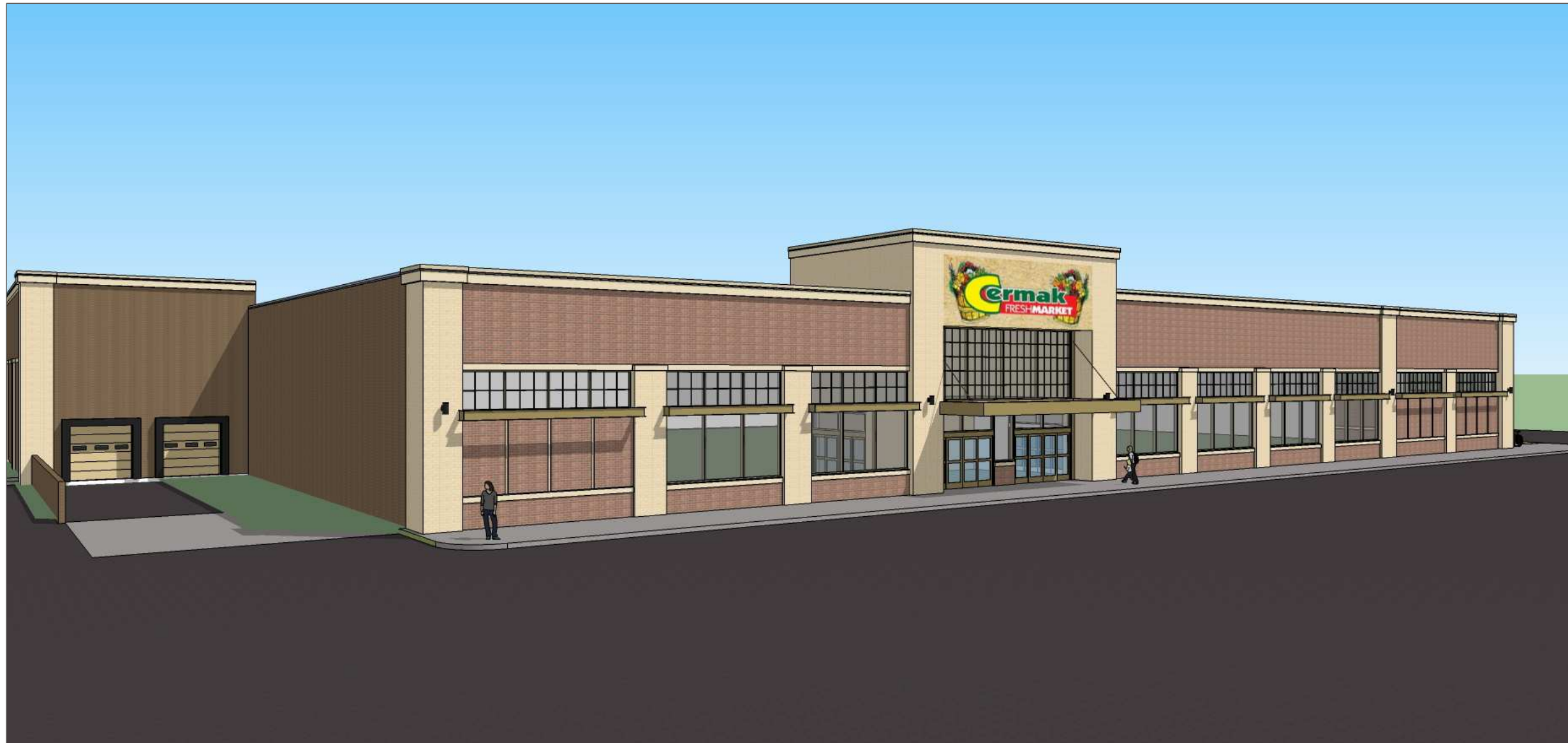
FRONT VIEW FROM NW

PROPOSED CERMAK AT FRESHWATER PLAZA 1st AND GREENFIELD MILWAUKEE, WI