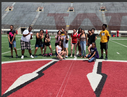
2019 SUMMER WRAP-UP