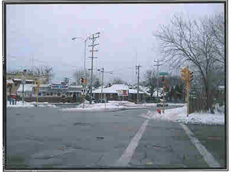
Looking West along Keefe Avenue