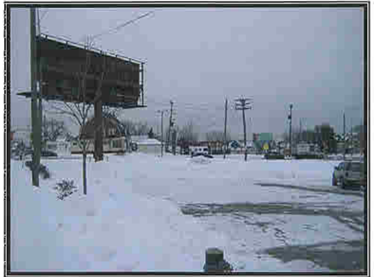
Looking North across Site