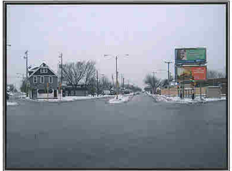
Looking Northwest along Atkinson Avenue