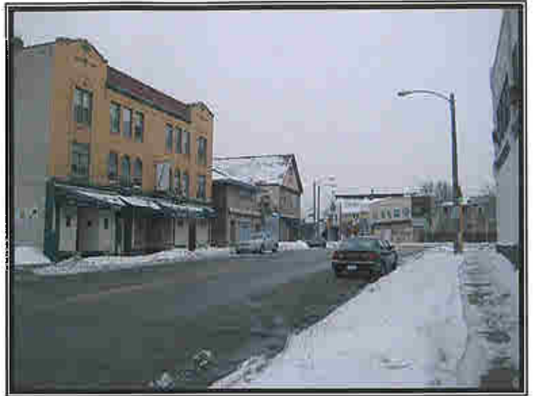
Retail uses Directly East of Site