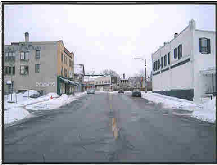
Looking South along Port Washington Road