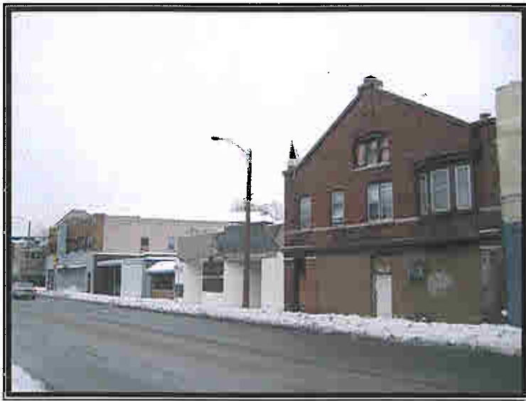
Vacant Retail Storefronts Directly West of Site