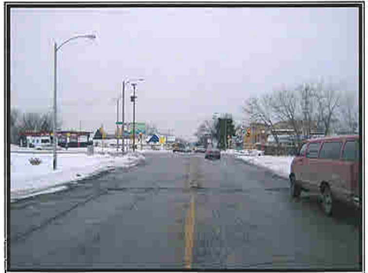
Looking North along Port Washington Road