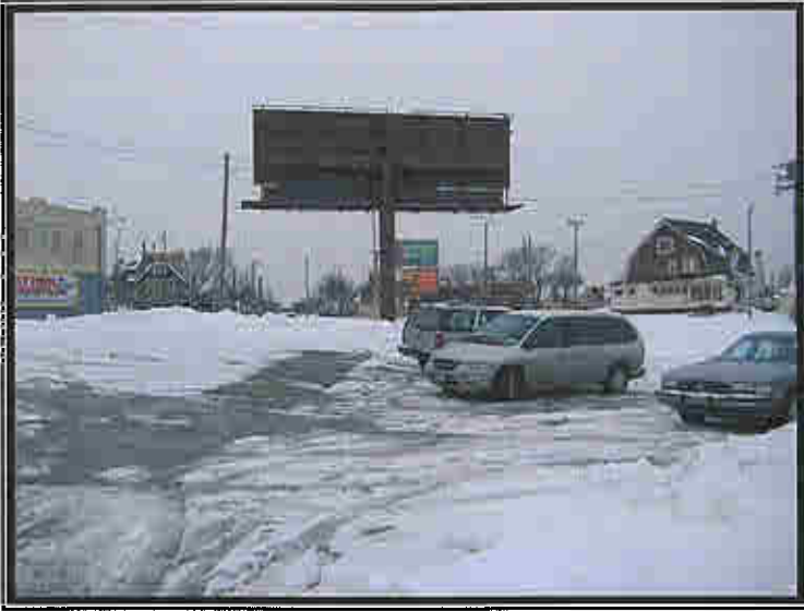
Looking Northwest across Site