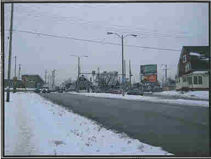
Looking East along Keefe Avenue