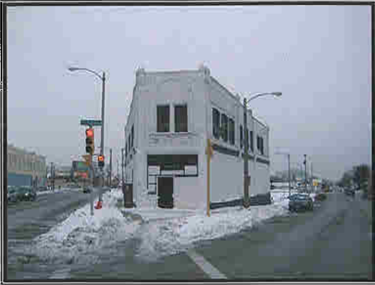
Looking North at Site