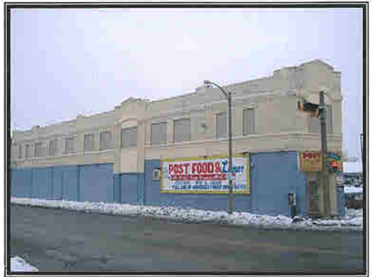
Post Food and Liquor Directly West of Site