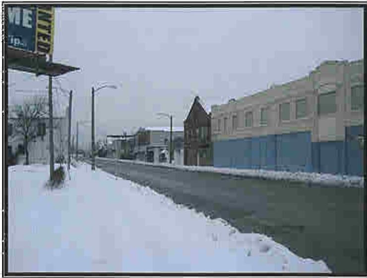
Looking Southeast along Martin Luther King Drive