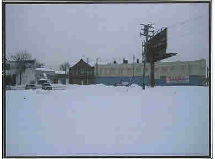
Looking Southwest across Site