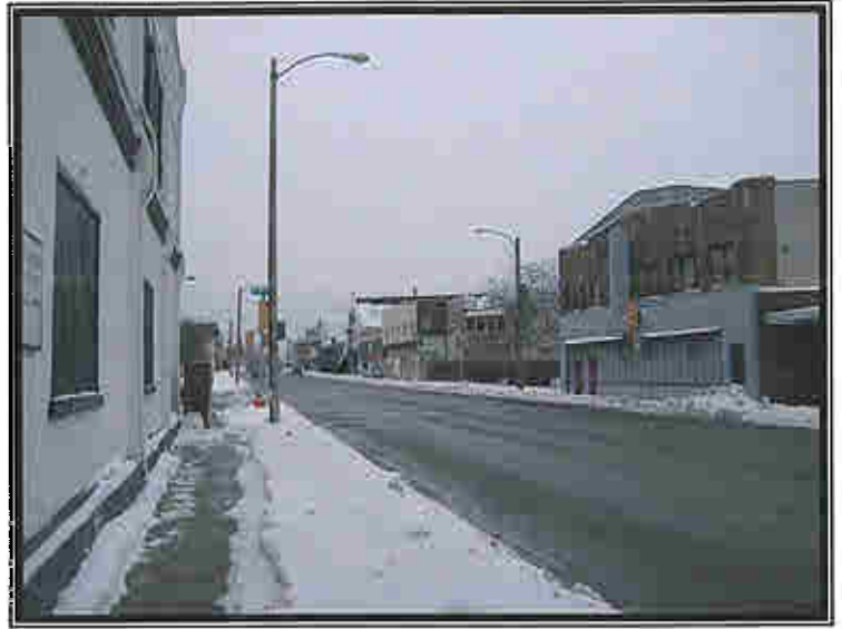
Looking Southeast along Martin Luther King Drive