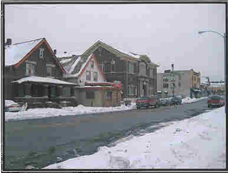
Retail uses Directly East of Site