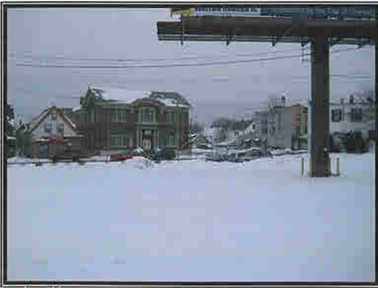
Looking East across Site