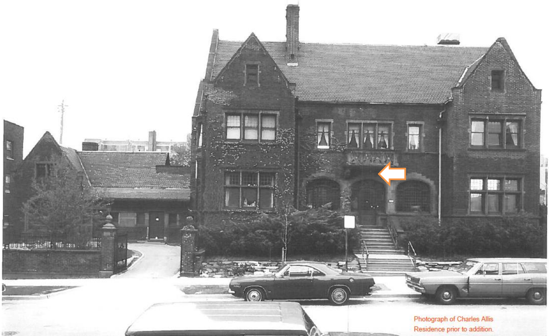
Photograph of Charles Allis Residence prior to addition.