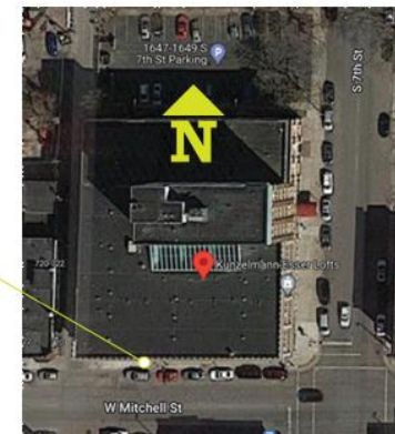
SITE PLAN - NTS