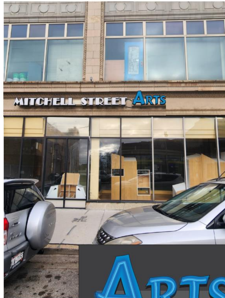
PROPOSED VIEW - NTS