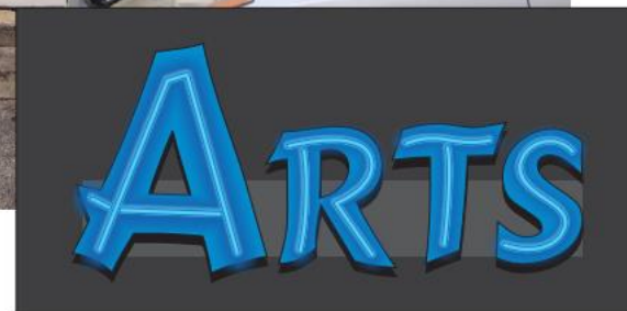
NIGHT VIEW - NTS