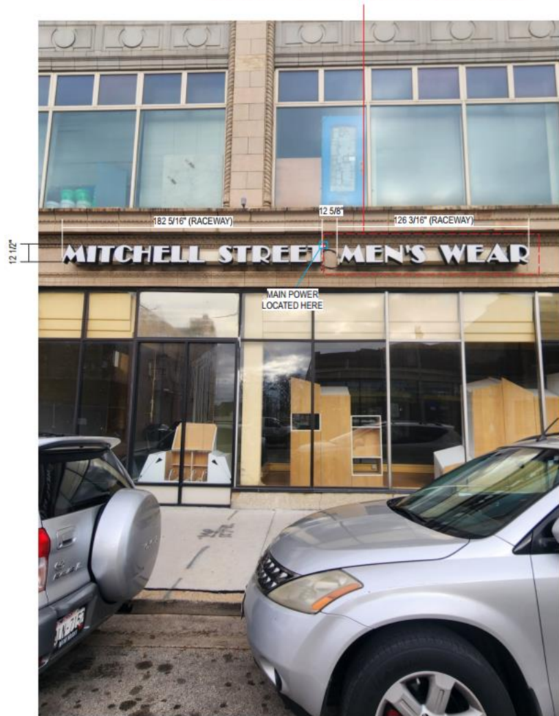
EXISTING VIEW - NTS

REMOVE EXISTING LETTERSET & RACEWAY AND REPLACE WITH NEW. PATCH MOUNTING HOLES AS NEEDED.