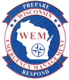
EXHIBIT C Wisconsin Hazardous Materials Response System