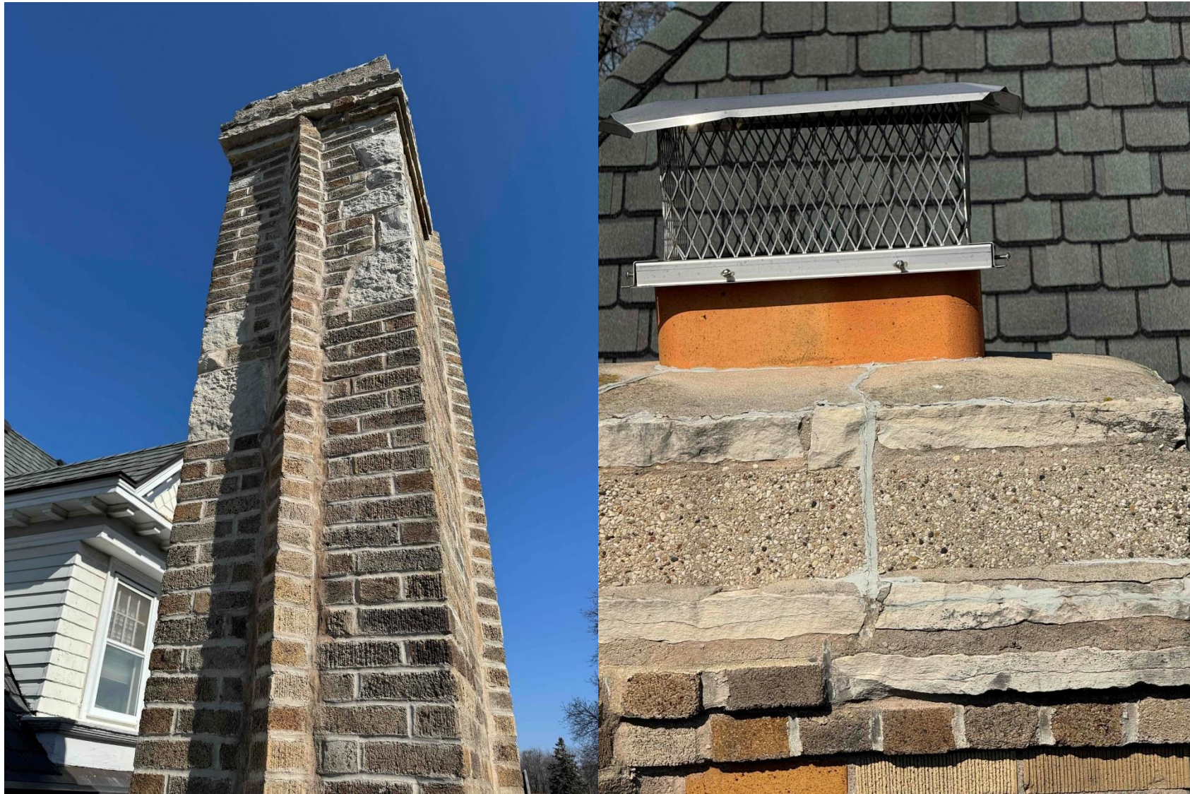
Chimney details. Note two complete courses of stone and one half course.